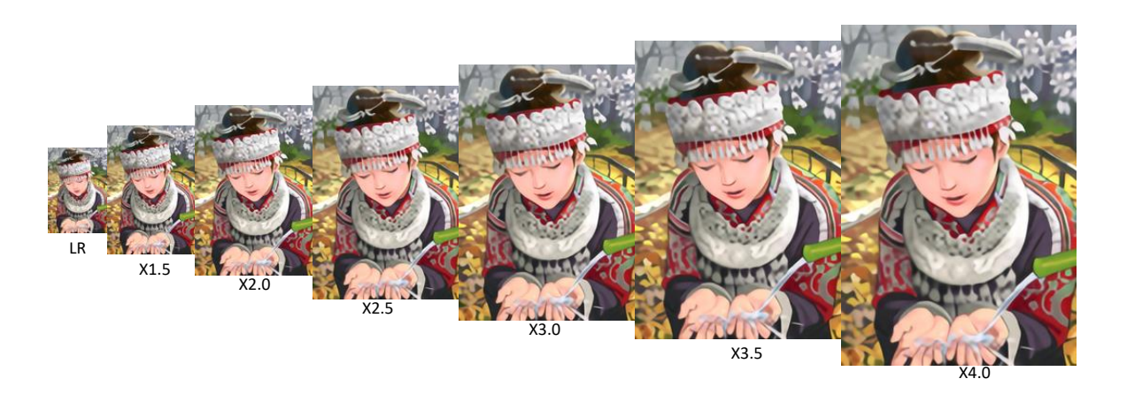
Figure 3. The visual comparison of an single image upsampling with different scale factors by our Meta-RDN.