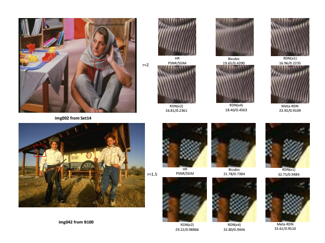
Figure 4. The visual comparison with four baselines. Our Meta-RDN has better performance.

We propose a novel upscale module named Meta-Upscale to solve the super-resolution of arbitrary scale factor with a single model. The proposed Meta-Upscale Module could dynamically predict the weights of the filters. For each scale factor, the proposed Meta-Upscale Module generates a group of weights for the upscale module. By do convolution operation between the feature maps and the filters, we generate the HR image of arbitrary size. Thanks to the weight prediction, we can train a single model for super-resolution of arbitrary scale factor. Especially, our Meta-SR can continuously zoom in the same image with multiple scale factors.