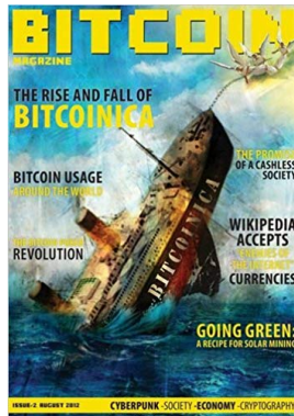
Figure 1: Bitcoin magazine from August 2012 showing one of the first disasters resulting from centralized crypto custody - Bitcoinica bankruptcy caused a huge price crash at the time.

The process of outsourcing crypto custody is quite risky. Some of the risks are: simply losing private keys [8], the death of private key managers [7], fraud, theft, insolvency, hacking and mismanagement of funds. In 2019, numerous cases like these took place in Brazil [9]. The risks apply both to the user, who has his funds lost irreversibly, and to the custodian who — unless he is the scammer himself — may be threatened or have his reputation destroyed forever. There are many risks to be taken into consideration (especially if the custodian himself is dishonest) even with security techniques to mitigate them, such as the use of cold wallets, multi-signatures and timelock, among others. Crypto theft is very attractive to criminals because it is irreversible and leaves little or no trace. When custodians collapse, it is difficult to know for sure whether the reason was incompetence in managing the funds, virtual or physical attacks or whether the custodians were scammers themselves.