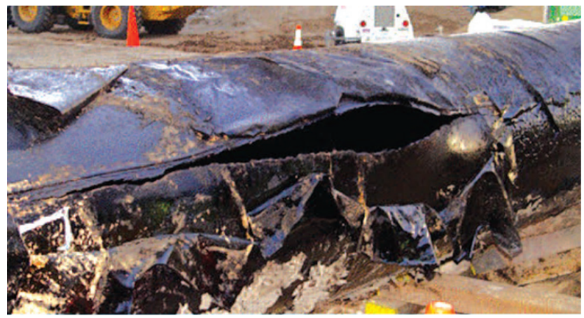
Ruptured Enbridge tar sands pipeline in Michigan, 2010. If Enbridge Corp. gets its way, corrosive and toxic tar sands oil may soon flow through its "Line 9" across the heart of Toronto.