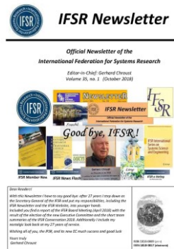
Fig. 4: Last Newsletter 2018

I sincerely thank all Editors-in-Chief and all contributors of the IFSR Newsletters for their support and supplied material in making the Newsletters a remarkable repository for the Systems Science world and for the IFSR in particular. On behalf of the IFSR, I have had all Newsletters scanned and collected. In 2021 the complete set of 74 Newsletters, a total of approx. 830 pages with a size of 88 MByte was donated to the ISSS (the International Society for the Systems Sciences).