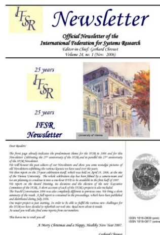
Fig. 3: 25th Anniversary Newsletter 2006

Initially the Newsletters were type-set and printed at high cost, from 1993 onward the Newsletters were produced by Desk Top Publishing. From 2000 onward the digital printing and e-mailing was done at the University of Linz and our member societies in order to distribute the electronic Newsletter.