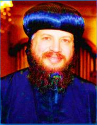
نيافة الأنبا يوسف أسقف جنوب الولايات المتحدة