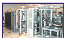
SMI-Lab equipment in the SNIA Technology Center, accessed from Santa Clara

For information about SMI and SMI-Lab membership, visit www.snia.org/smi .