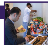
NetApp provided a continental breakfast, coffee, and lunch daily.