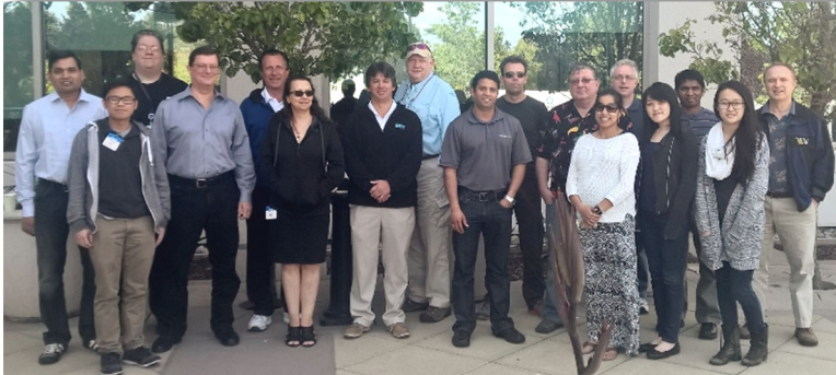
Attendees in Sunnyvale