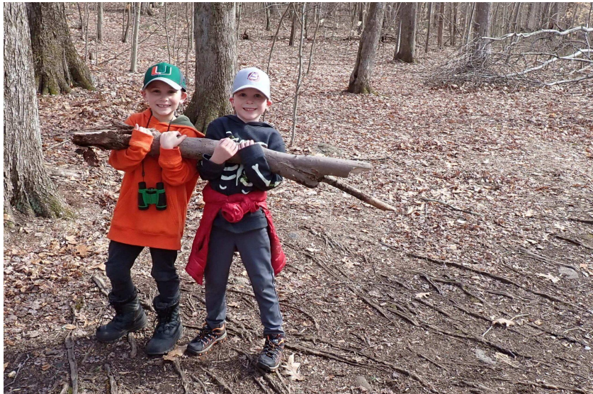
Kids helped collect firewood during the annual Marshmallow March.