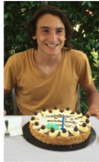
With my family, two years ago