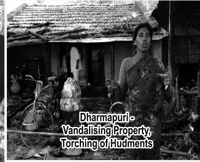
Dharmapuri - Vandalising Property, Torching of Hudments