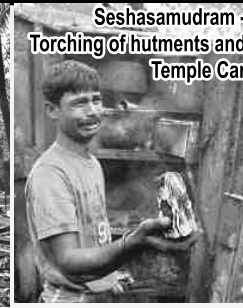
Seshasamudram - Torching of hutments and Temple Car