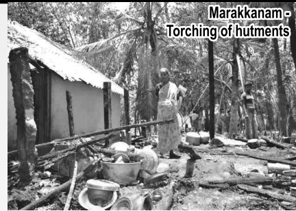
Marakkanam - Torching of hutments

benefited and have been strengthened through the state welfare schemes and agreements. Officials, political leaders and Panchayat contractors have formed a new breed of alliances to aggravate caste and caste-fanaticism. Not only in Tamil Nadu but across India, it has come to pass that caste-associations are established and manifest themselves as political parties with their own caste as the exclusive foundational base. Parties like the DMK and the AIADMK that yearned to target majoritarian castes as