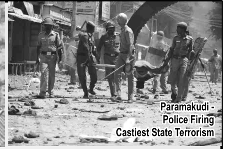
Paramakudi - Police Firing Castiest State Terrorism