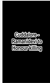
Guddalore - Ramanidevi to Honour killing