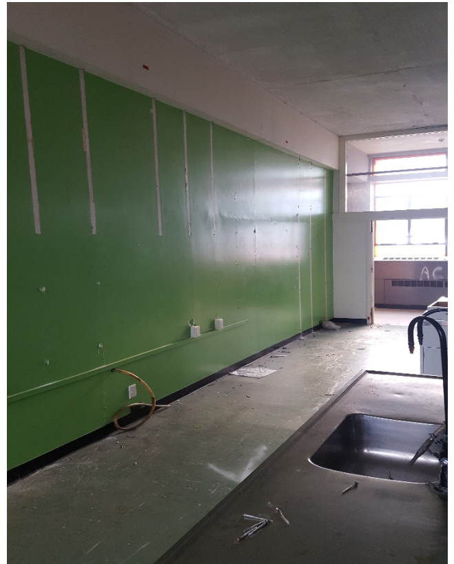
Level 1 and 2 strip out, before setting up enclosures, sealed areas with ACD contamination