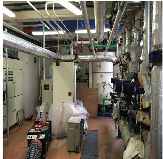
Plantroom 119 NPU set up