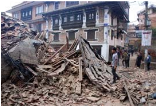
Damage in Swatha Square in Kathmandu.