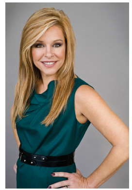
LEIGH ANNE TUOHY

Purchase your tickets at: www.brownpapertickets.com or call 1-800-838-3006