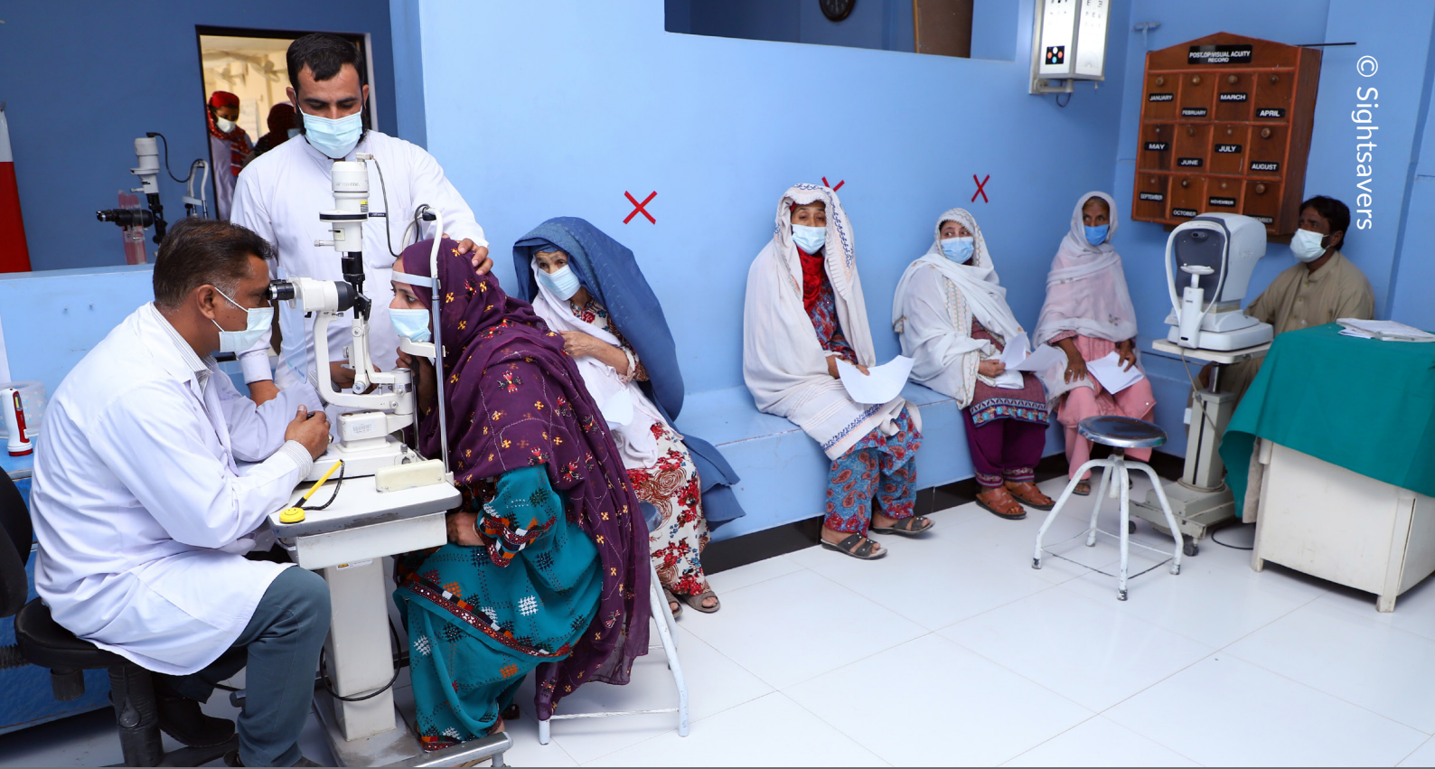
Women queue for their eye health appointments at LRBT Hospital in Quetta.