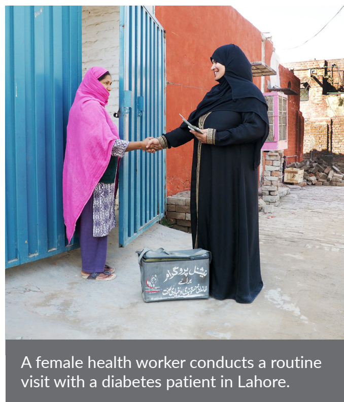
A female health worker conducts a routine visit with a diabetes patient in Lahore.

Sightsavers, along with other international organisations, has been investing resources in strengthening eye health systems in Pakistan since 1998. This has been through advocacy, research, evidence-based programme implementation, the development of human resources for eye health, and improving eye health service delivery, infrastructure and management information systems.