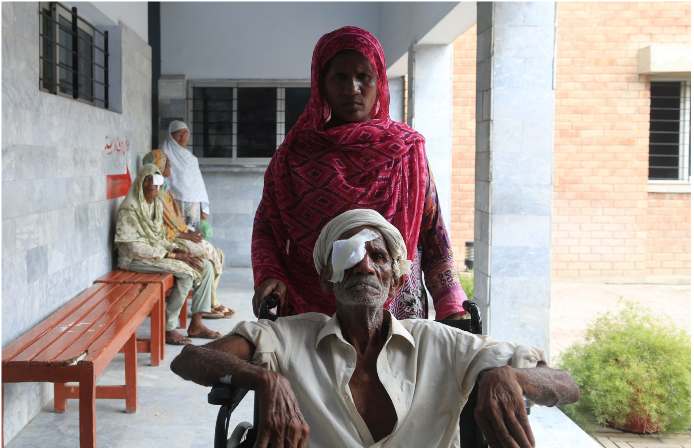
A man with disabilities leaves LRBT Hospital in Quetta after receiving free cataract surgery.

Comprehensive eye care (CEC) cell Sindh is the first province to get the provincial IPEC plan formally endorsed by the Directorate General of Health. The plan was presented at the Sindh Provincial Eye Health Committee annual meeting, where it was approved and endorsed by the Secretary Sindh (the highest rank in health bureaucracy).