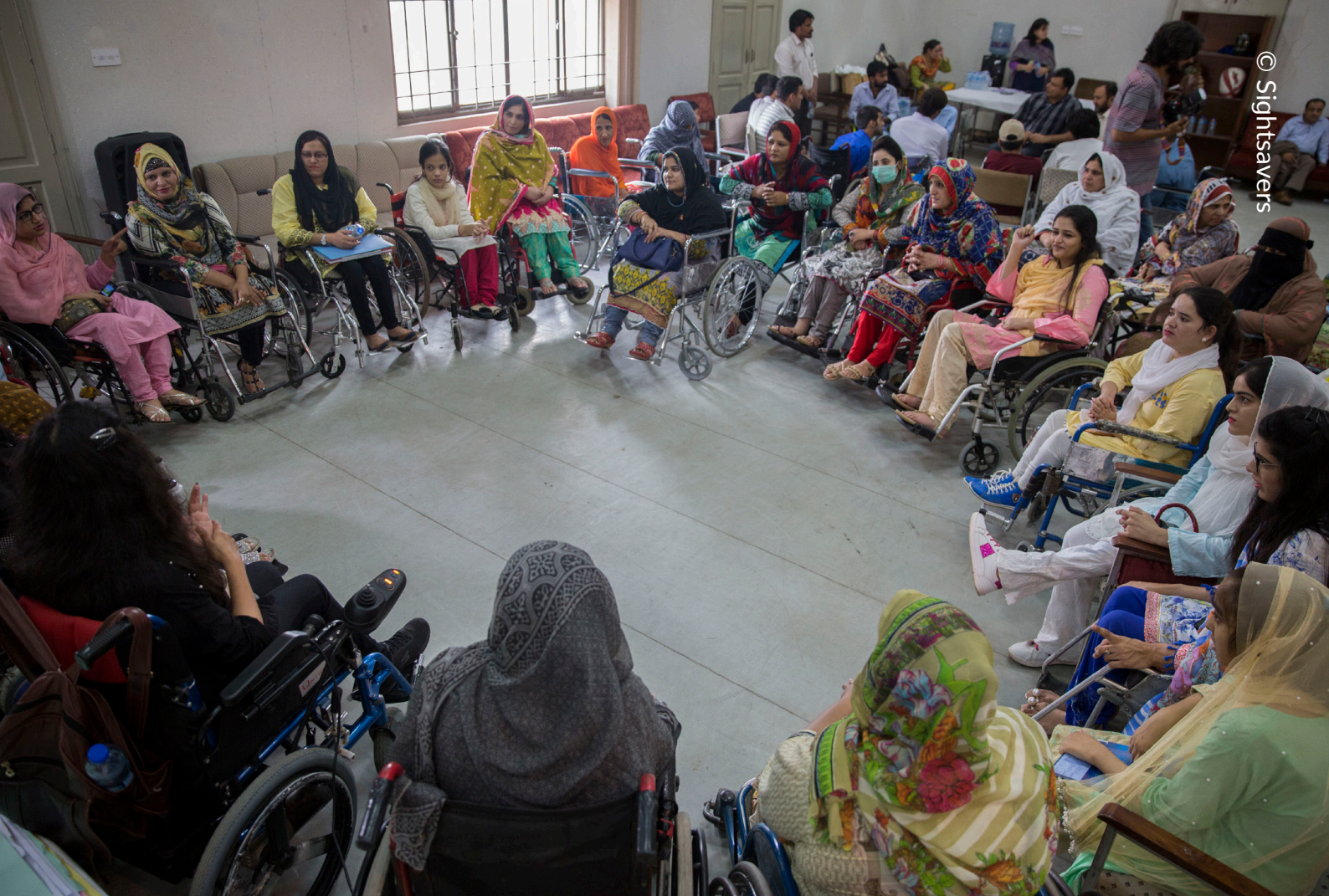
A meeting led by women with disabilities at the Equal World campaign launch in Islamabad in 2019.

Following the agreement of stakeholders on the development of IPEC plans for provinces and national level, the development process for IPEC plans started in early 2020. The IEH task force under NCEH took the lead on the process of IPEC plan development, with support from Sightsavers and other key stakeholders including OPDs. The following key steps were taken in this regard: