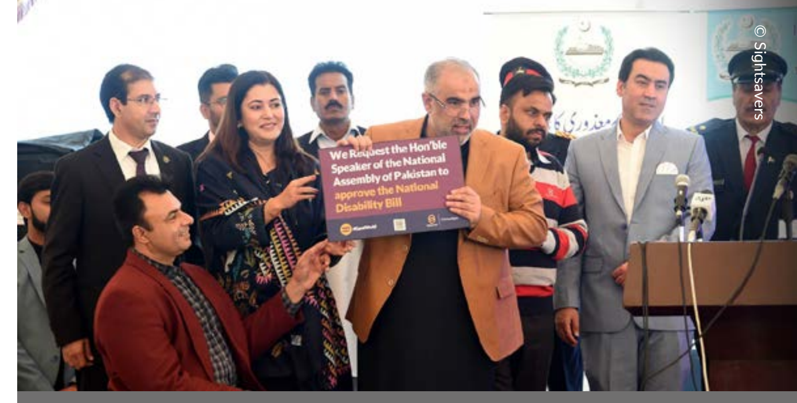
Speaker of the National Assembly of Pakistan endorsing Sightsavers' Equal World campaign's key ask for the approval of the national disability bill.

A disability access audit, led by a team of people with disabilities, was carried out for the parliament house building, followed by the implementation of the recommendations of the audit.