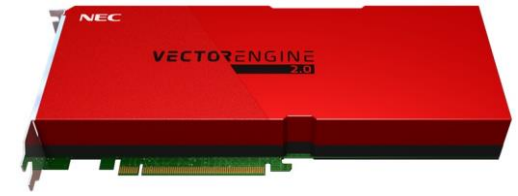
NEC Vector Engine

Large Grid size performance on VE is better than CPU!