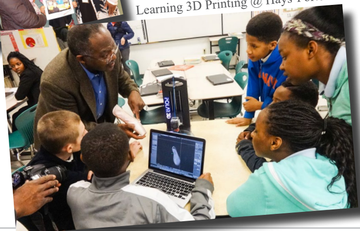
Learning 3D Printing @ Hays-Porter

Special thanks to UC students who helped us with our "Computer Station", and to "Polar 3D" for providing a 3D printer!