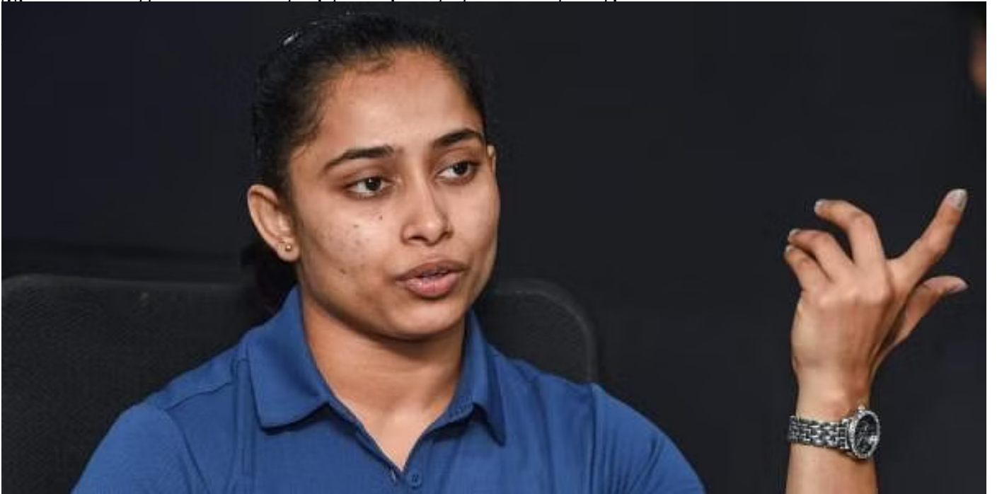
Gymnast Dipa Karmakar handed 21-month ban after failing dope test