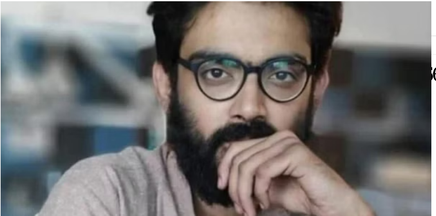
Delhi court discharges Sharjeel Imam in 2019 Jamia violence case

Now we are on Telegram too. Follow us for updates