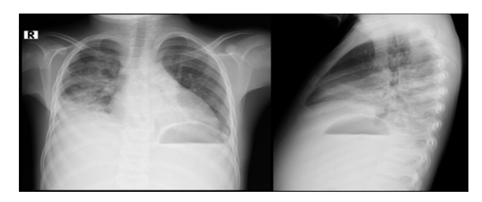
Figure 3. Image showing worsening of the lesions of right basal bronchopneumonia with low abundance pleural effusion and on the left barely a perihilar infiltrate in case 1