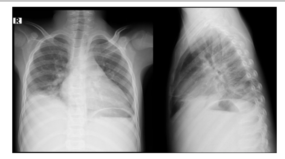
Figure 1. Image showing a right postero-basal alveolar focus in case 1

500 mg of Hydrea and 500 mg of Deferiprone. His history indicates that he had already been transfused 7 times and hospitalized following pneumonia in 2015. Eleven months before this admission, he had suffered a stroke and had been put on a transfusion exchange program. He was of normal weight for his age. The initial blood count showed a hemoglobin level of 5.7 g/dl with normal values for liver and kidney functions. The C-reactive protein was 24 mg/l. The chest x-ray on admission showed the presence of a right postero-basal alveolar focus, a normal aspect of the hilum, a cardio-thoracic index (CTI) corrected in the standards, the whole suggesting a right basal pneumonia (Figure 1). We therefore concluded in an Acute Thoracic Syndrome. Parenteral therapy with ceftriaxone and amikacin was started without success for 10 days for ceftriaxone and 5 days for amikacin. During his stay in hospital, the patient was transfused twice to correct his anemia and at the same time manage his painful crisis.