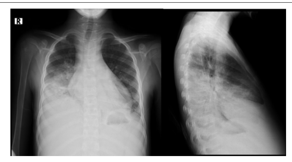
Figure 2. Image showing a normal aspect of the hilum and a right postero-basal alveolar focus with air bronchogram in case 1