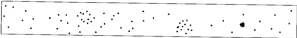
Typical Quantity and Size Permitted in 6 in. (150 mm) Length of Weld Over \frac{1}{2} in. (13 mm) to 1 in. (25 mm) Thickness