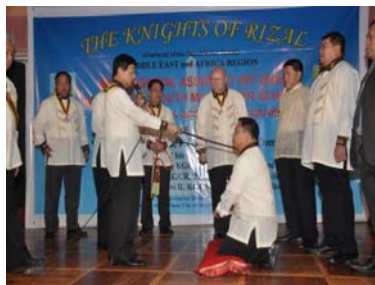
The Supreme Commander dubbing new MEA Knights.