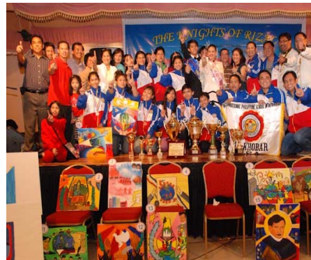
IPSA—2009 Overall Champion