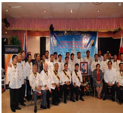
OKOR MEA Knights