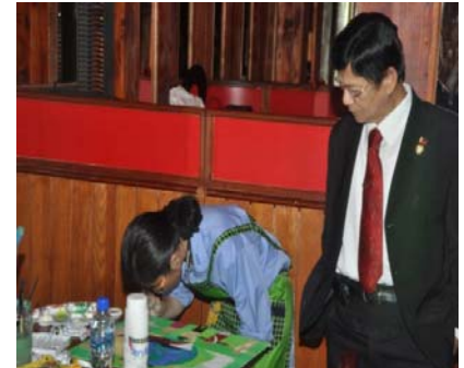
The Supreme Commander inspecting the On-the Spot Painting Contest