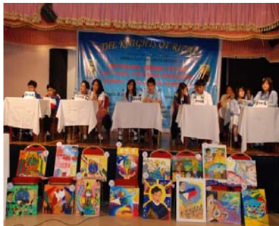
Battle of the Brains Contest