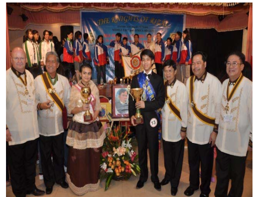
Young Jose Rizal & Young Maria Clara Champions 2009