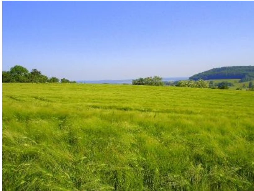
On the way up to Bauffremont castle...

grandmother of the Prince was the last descendant of the Counts/Lords of Sully, and eventually sold the castle to the town of Sully-sur-Loire .