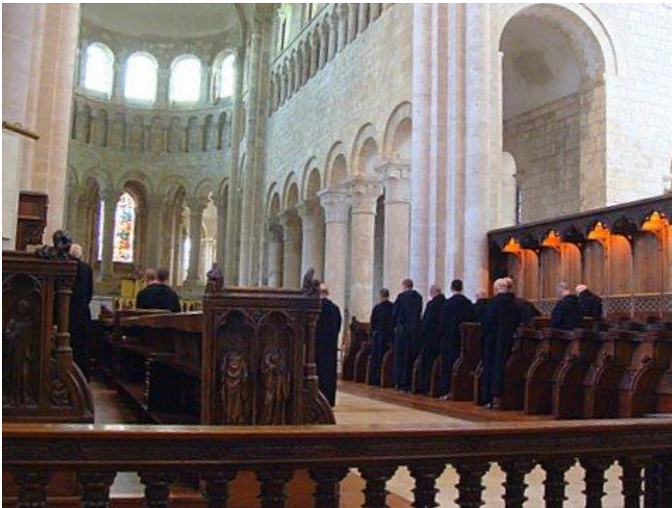
Benedictine monks singing Psalms during a short service at St-Benoit-sur-Loire

Today a community of approximately 40 monks resides within its walls. They still follow the Rule of St Benedict, and sing Gregorian chants during some of their short services, one of which we plan to attend. You may participate in prayer services with them if you like. There are 6 different services each day, some very short (as short as 15 minutes), and also longer ones (as long as 75 minutes). Sometimes they sing the psalms, and sometimes the very old Gregorian chants. In any case, your singing along is optional!