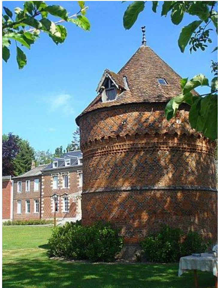
"La Compassion" Centre Mambre-Monastery outside of Rouen