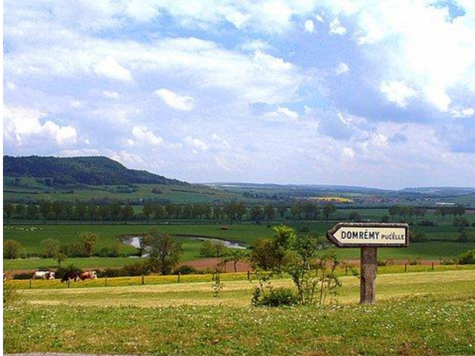
A couple of kilometers from Joan's home town of Domrémy-la-Pucelle (i.e. Domrémy the Maid)

We'll have a guided visit of Joan of Arc's house. We'll also spend some time at the Basilica dedicated to her, the Fairy Tree location (the tree is no longer there, being cut down in the 17th century) and the "Fountain of the Fevers", where Joan stated she often heard her "voices". A small fountain still flows there, and is to this day very calming and pastoral.