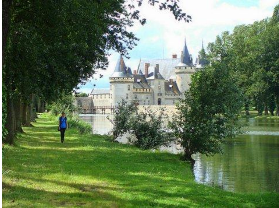
Picnic area at Sully-sur-Loire

- Jargeau is a small town on the southern bank of the Loire , about ten miles east of Orléans . The Battle of Jargeau took place on June 11-12, 1429. It was Joan's first offensive battle, and was the first sustained French offensive in a generation. Le Duc d'Alençon, Joan's friend and a commanding officer said, " Joan breathed the will of God into French troops, ensuring them their victory, saying, 'Act, and God will act!' ... a stone hit her on the head (it split in two against her helmet as she climbed a scaling ladder), causing her to fall, but driven on by her determination she got up and exhorted her companions forward ... the French (then) took Jargeau, and set off in pursuit of the running English. " The English suffered heavy losses.