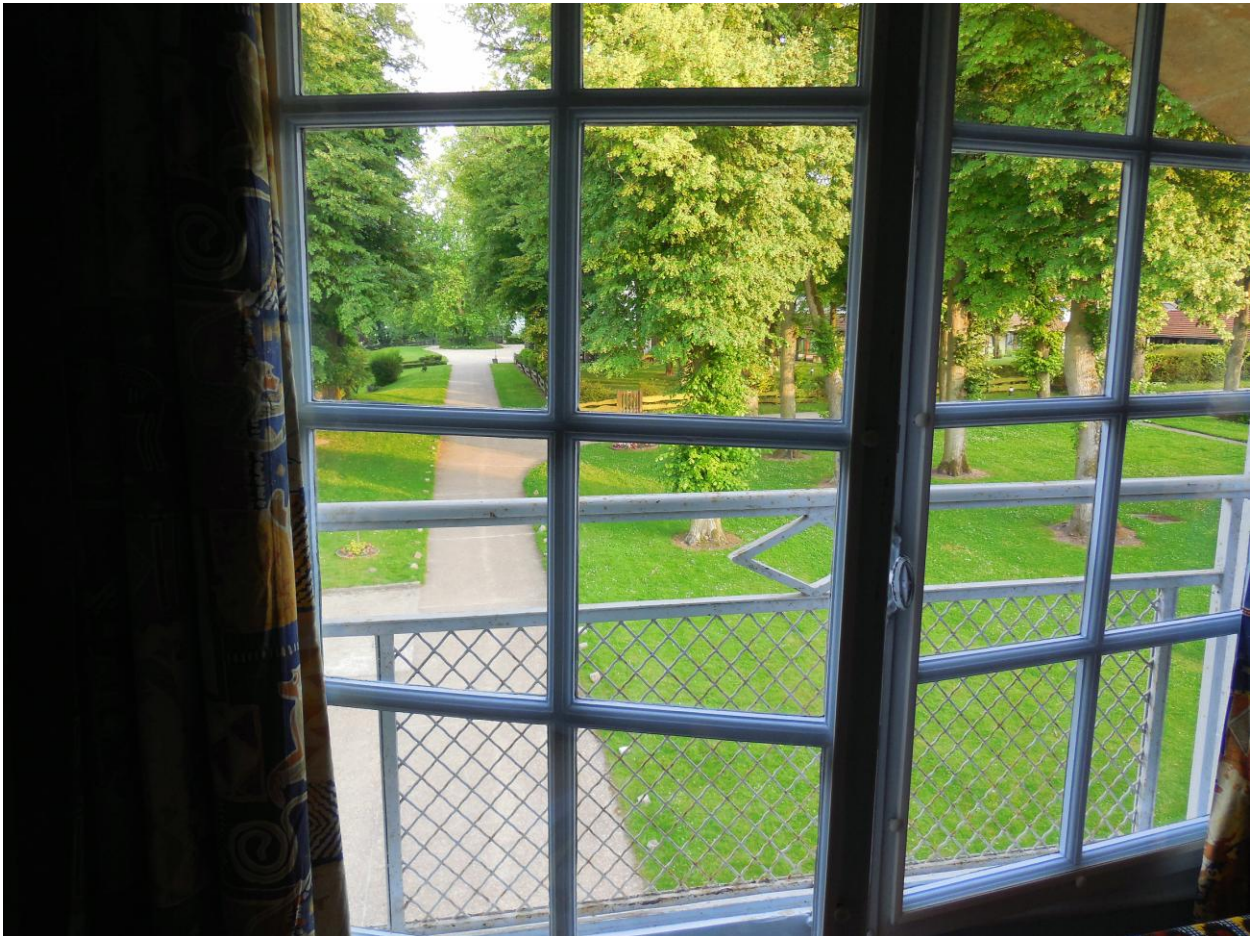
From our rooms, overlooking a small part of the St. Thierry monastery grounds..

The Benedictine Sisters are a very hospitable community. They will serve us our meals while in Reims (the food is simple here, healthy and typically French). For those interested, you may attend some of the Sister's prayer services, and/or hear their soothing singing, in their 12th century chapel. Also for those interested, we will be meeting with one of the sisters, who will talk a little about their community life of prayer, hospitality and work, and answer any questions you may have.