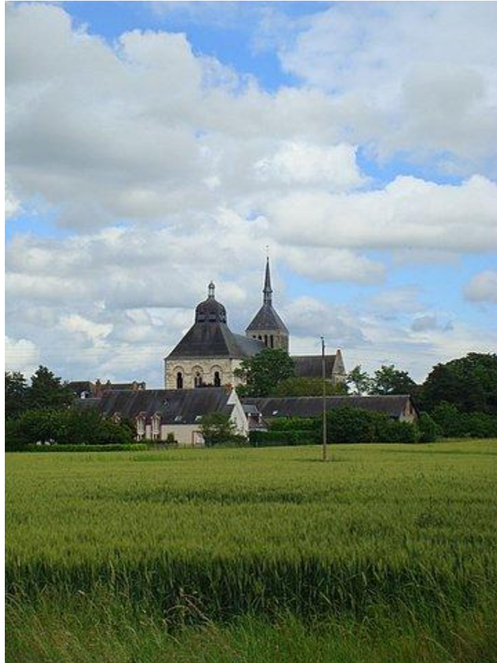
The ancient Benedictine Monastery of St-Benoit-sur-Loire (i.e St. Benedict on the Loire River )

After our visit at Chartres, we will continue to Orléans , where in a nearby small town, we'll check in to our home for the next 3 days: the world-renowned Benedictine monastery St-Benoit-sur-Loire . It is located on the Loire River, and will be a welcome respite from the 'big city' of Orléans . It has been nearly ten years since we brought a group of pilgrims to stay there, and we are thankful that these Benedictine monks have again agreed to welcome us. It is a privilege, as they don't accept everybody.