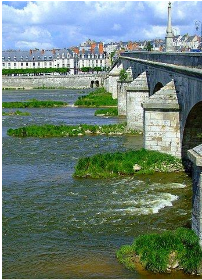
Along the lovely and historic Loire River