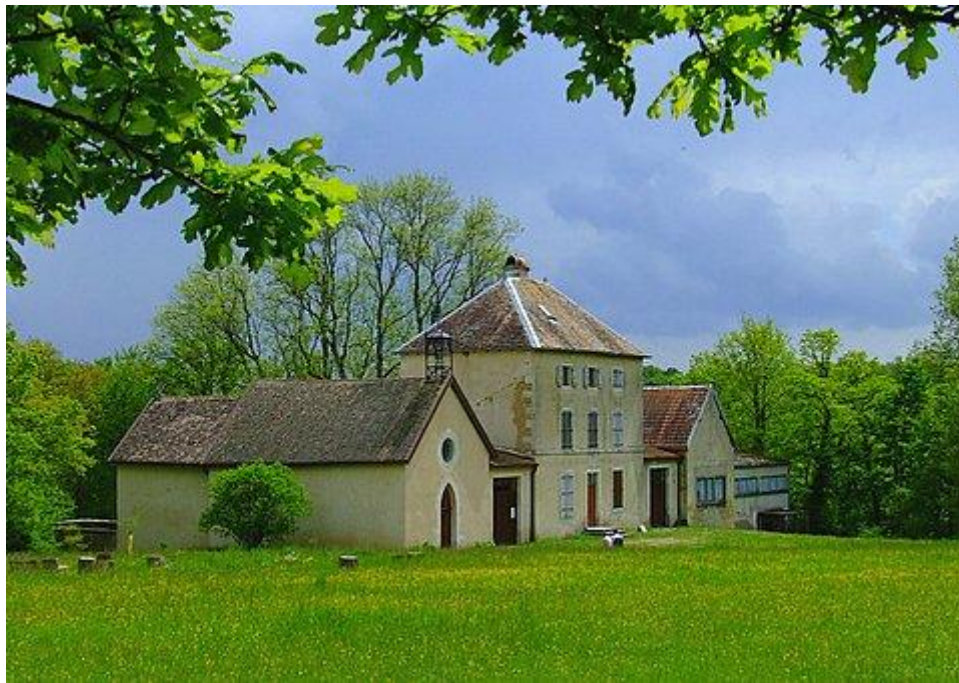
La Chapelle de Bermont