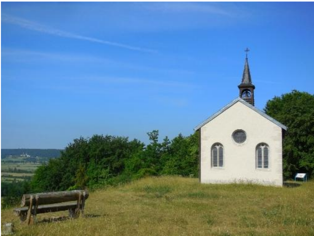
La Chapelle de Beauregard

La Chapelle de Beauregard - This literally means ‘the Chapel of the Beautiful View’! Overlooking the Valley of the Meuse River, this site is well deserving of its name. For centuries sitting in the heart of a hillside wooded area, it still remains a harbor of peace today. This Celtic chapel has been frequented since the 13 th century. When Geoffroy de Bourlemont came back here safe and sound from his 7 th crusade, he decided to build this beautiful small chapel on a plateau on a hill in this idea environment. It has just recently been restored. The residents here have always heard the stories, passed down from generation to generation, about how this was a dear place to Joan of Arc, who came here often to pray. On the way, we’ll pass through the small neighboring village, Maxey-sur-Meuse . Maxey, a small charming village now, was Burgundian during Joan’s time, and the Domremy children often had neighborhood scuffles with the Maxey kids.