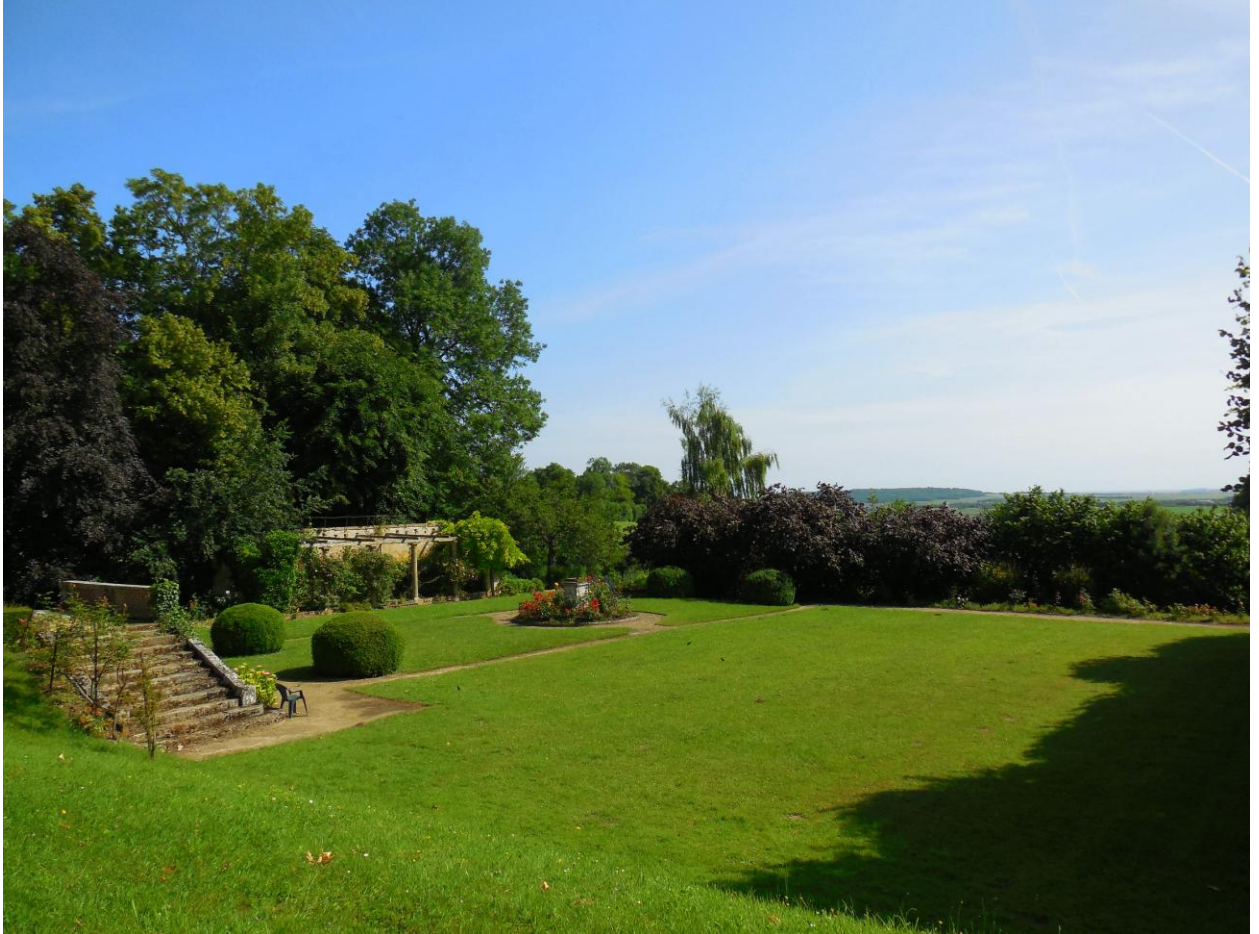
Overlooking part of the sister's gardens at St. Thierry.