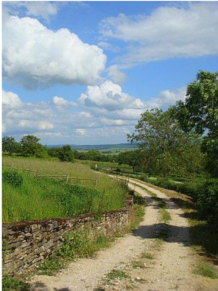
The highways and byways of Bauffremont

Bauffremont -The sumptuous meal at Bauffremont , and wonderful people we have shared it with, have certainly been a highlight for many of our former pilgrims. The ruins of their castle sits on a hillside, overlooking a large beautiful valley, full of history. The Prince and Princess of Bauffremont are indeed a real Prince and Princess. However, even though descendants of royalty, they are both very kind and down to earth.