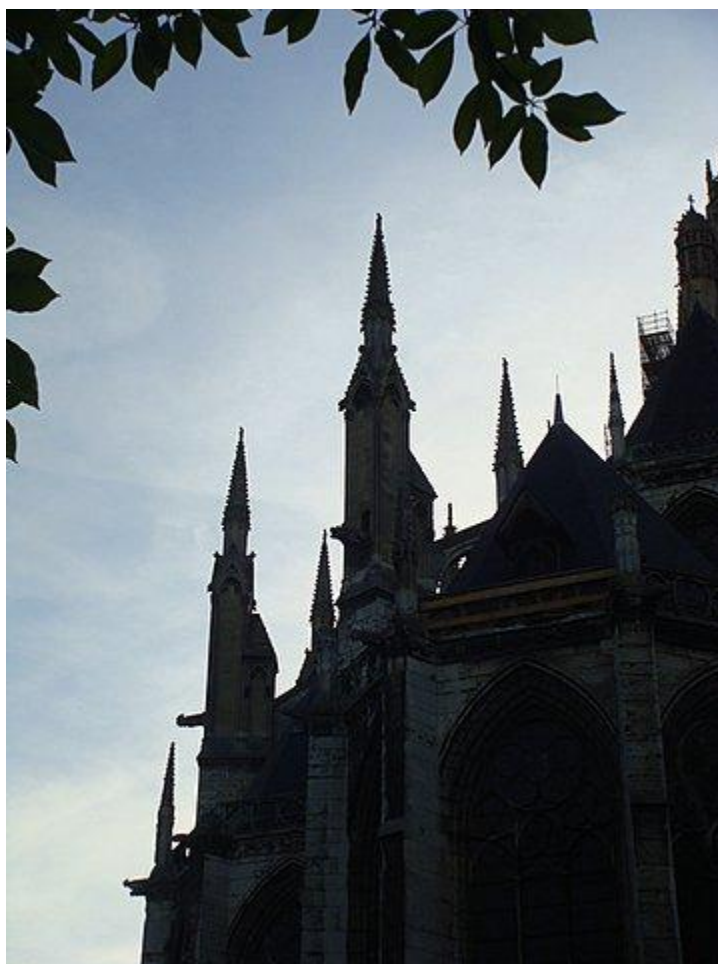
St Ouen, Rouen-where Joan's adjuration took place.

June 18-21, 2016, 'Base Orléans', via Chartres. Leaving Rouen we will head towards Orléans , scene of Joan's history-changing battle. But on the way, we'll make one important stop: the famous cathedral of Chartres . Since it lies directly on our way, we cannot in good conscience pass it by. It is certainly one of the most beautiful cathedrals in France, known the world over for its exceptional blue stained glass windows. The majority of these stained glass windows are the originals from the 13th-14th centuries. It is a miracle that they survived World War II. Joan of Arc's mother, Isabelle Romée (1377–1458) would have seen these very windows while there. The architecture has seen only minor changes since the early 13th century. All in all, it is in an exceptional state of preservation, is considered one of the finest examples of French Gothic architecture and is a UNESCO World Heritage Site.