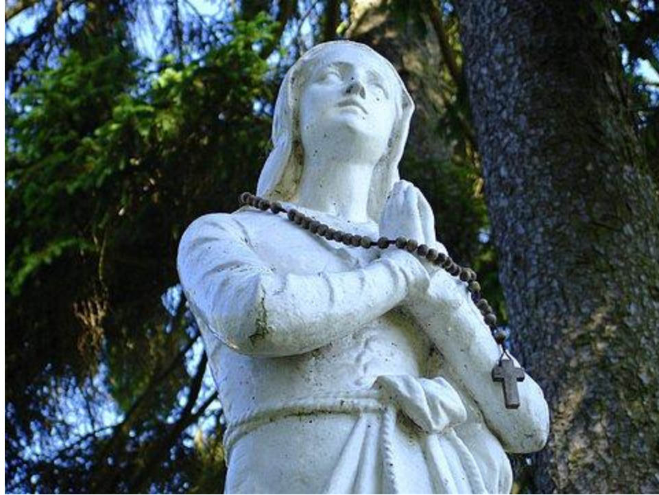
At the location of the Fairy Tree and the "Fountain of the Fevers"

You'll also have some time to explore on your own and visit her childhood church St. Remy, where she stated St. Margaret appeared to her. It still serves as the village church to this day.