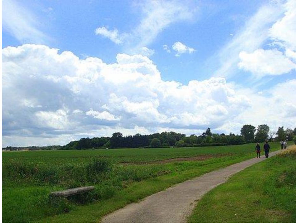
Heading to the Loire River, a couple minutes from St Benoit monastery.