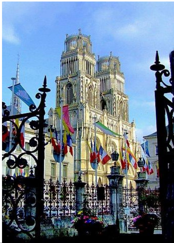
Cathédrale Sainte-Croix d'Orléans

Mass we were served a wonderful lunch. We are hopeful they'll be able to do the same for us in 2016.