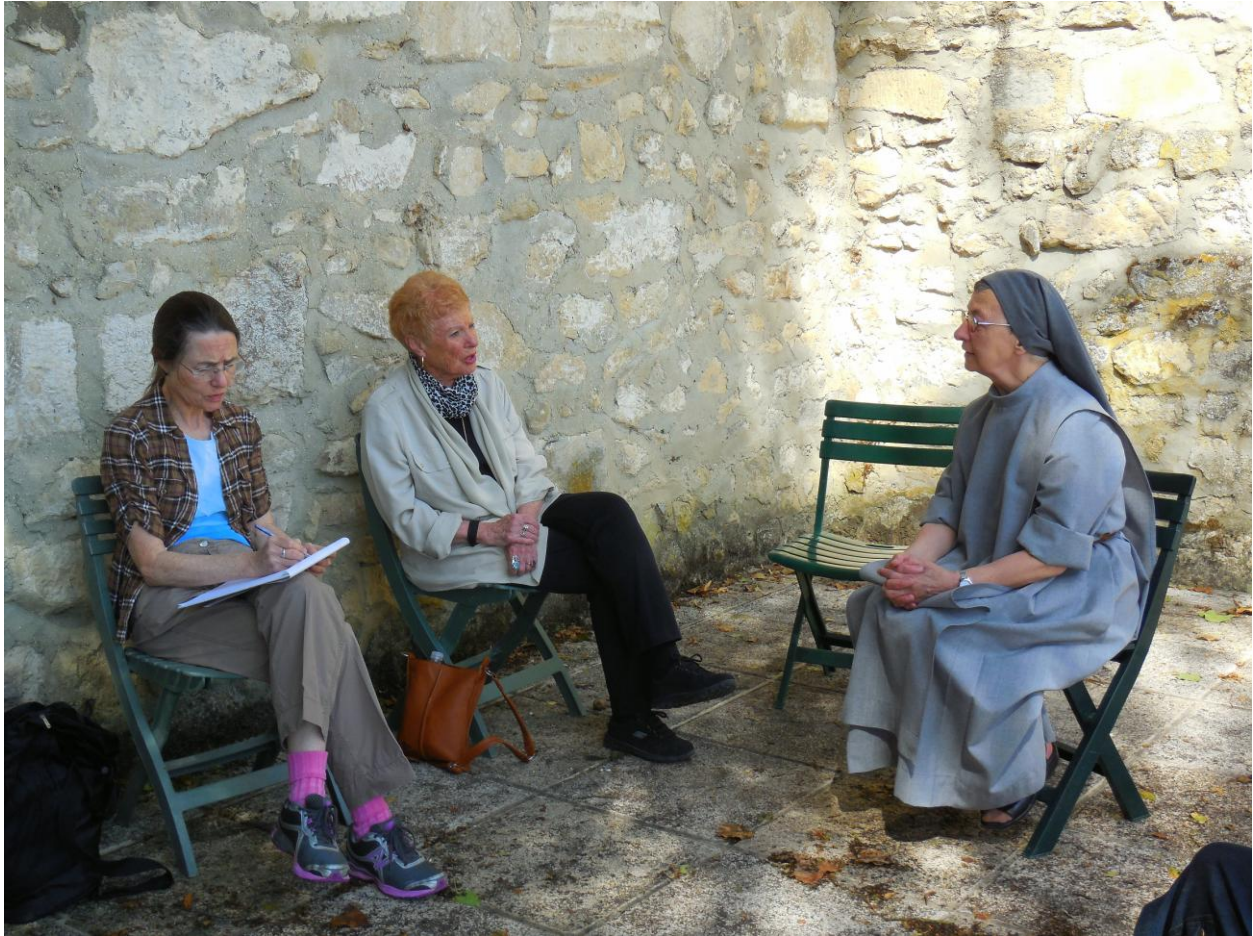
A sister speaks to us about their monastic life at St Thierry.

June 25-26, 2016, Paris-CDG airport: We'll spend our last night near Paris, in a hotel next to Charles de Gaulle airport. Here we'll have our farewell dinner on June 25, after which the pilgrimage draws officially to a close.