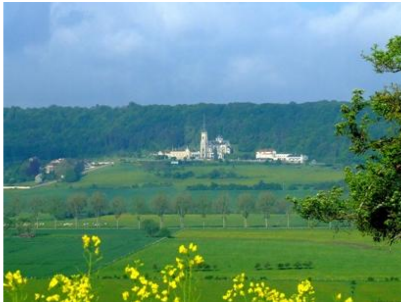
Across the valley we see the Joan's Basilica, just outside of Domrémy.

We'll have a guided visit of Joan of Arc's house. We'll also spend some time at the Basilica dedicated to her, the Fairy Tree location (the tree is no longer there, being cut down in the 17th century) and the "Fountain of the Fevers", where Joan stated she often heard her "voices". A small fountain still flows there, and is to this day very calming and pastoral.