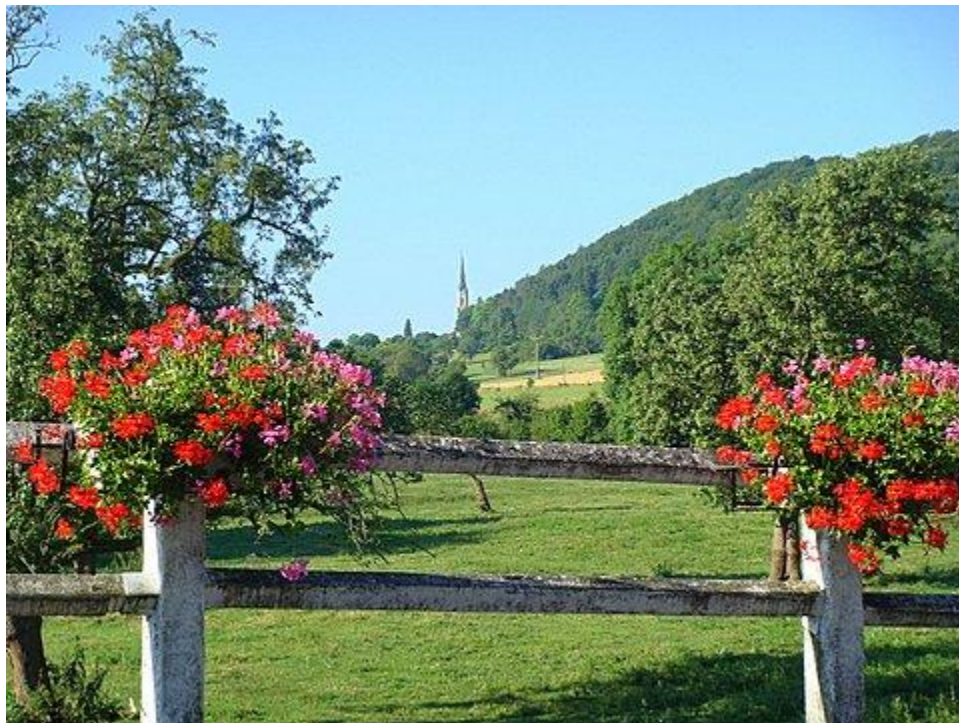
From the small village of Domremy: in the distance is the Basilica dedicated there to Joan of Arc.

June 21-24, 2016, 'Base Domrémy-la-Pucelle': There are some great reasons to spend time in Joan of Arc's birthplace, Domrémy-la-Pucelle (meaning Domremy the Maid). For one, it is located in a rural and beautiful part of France. This area is a good example of 'la France profonde' . This means 'the deep France', i.e. the lovely pastoral countryside that few tourists ever see, much less experience. Also, Domrémy-la-Pucelle is a wonderful place to search for both Joan's roots and her spirituality. As you might imagine, there is a wealth of Joan of Arc experts living in this area. In the past, they have been very generous to us with their time, expertise and warm hospitality. We will take advantage of this again in 2016.