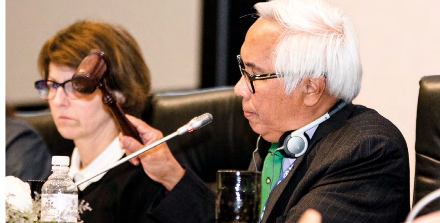
IPBES Chair Abdul Hamid Zakri gaveling the approval of the Summary for Policy Makers (SPM) of the Thematic Assessment on Pollinators, Pollination and Food Production. Source: IPBES-4, Kuala Lumpur, Malaysia 2016. Source: IISD/ENB | Diego Noguera

website within a short period of time before the plenary. They are numbered as IPBES/PlenaryNumber/DocumentNumber .