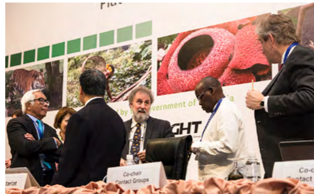
IPBES-4 Chair Abdul Hamid Zakri and incoming IPBES Chair Robert Watson in consultations with panellists during plenary, IPBES-4, Kuala Lumpur, Malaysia 2016.

Election of experts for the Multidisciplinary Expert Panel (MEP) and the Bureau: Only IPBES member states are authorized to propose and elect members of the MEP , according to decision IPBES-1/1 and IPBES-2/1 and the Guidelines for the nomination and selection of MEP members. To ensure continuity in the work of the MEP, not all 25 MEP members (5 per UN region) will be replaced after one term. At IPBES-5, four members of the MEP (one alternate from the Latin American region, two from the Eastern European region, and one from the African region) will be replaced.