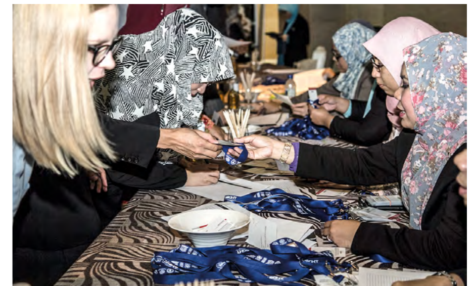
Registration of delegates at IPBES-4, Kuala Lumpur, Malaysia 2016.

Interested individuals not affiliated to an organisation with observer status should contact accredited organisations in their region or field of expertise (see list of observers www.ipbes.net/accredited-organisations ). One of these organisations might be willing to include additional people in their delegation.