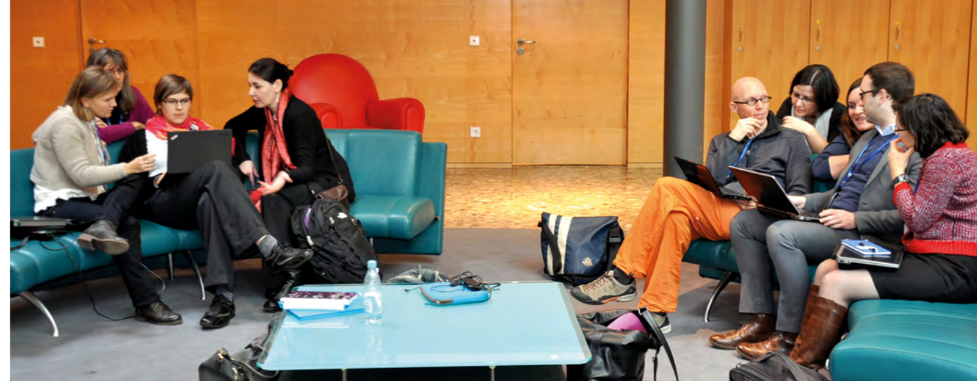
Consultation by members of the Coordinated Stakeholders group, IPBES-3, Bonn, Germany 2015

Sharing information from contact groups: During contact groups, comments and text changes presented by delegates should not be shared publicly. Reporting/tweeting on the ongoing negotiations is not recommended.