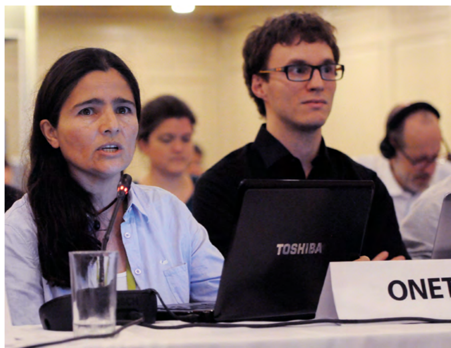
Statement by the open-ended Network of IPBES Stakeholders at IPBES-6, Medellín, Colombia 2018.

Stakeholder delegates who presents the intervention should identify themselves and the agenda item they wish to comment on.