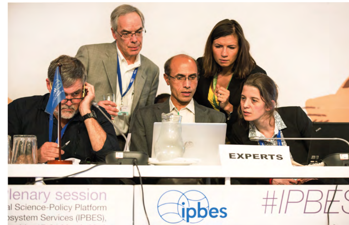
The dais during the Contact Group on Land Degradation and Restoration Assessment, IPBES-6, Medellín, Colombia 2018.

At IPBES-7, certain agenda items will be discussed in contact groups, before a final decision on the item will be made in the plenary session. At previous IPBES Plenary meetings, some contact groups met in parallel, while others were held during lunch or dinner breaks. Information about which items will be addressed in which contact group will be presented in the latest version of the annotated agenda ( www.ipbes.net/event/ipbes-7-plenary ).