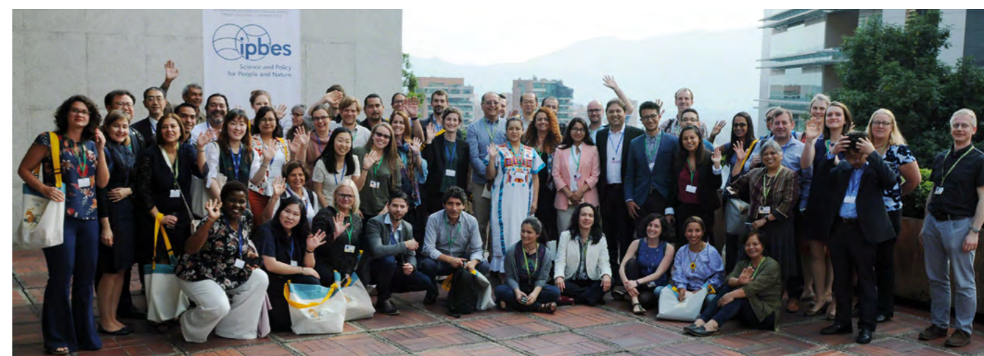
Participants of the Stakeholder Day prior IPBES-6 at the end of Saturday's proceedings, Medellín, Colombia 2018.

Stakeholder initiatives that support the IPBES work programme could be showcased (depending on available time). Prior to the meeting, examples from stakeholders who will participate in the meeting or who will follow the live-stream can be collected through the TRACK database. The template is available here: www.ipbes.net/impact-tracking . Further information will be displayed on the ONet webspace in this regard.