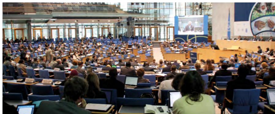
A view of the plenary, IPBES-1, Bonn, Germany 2013.