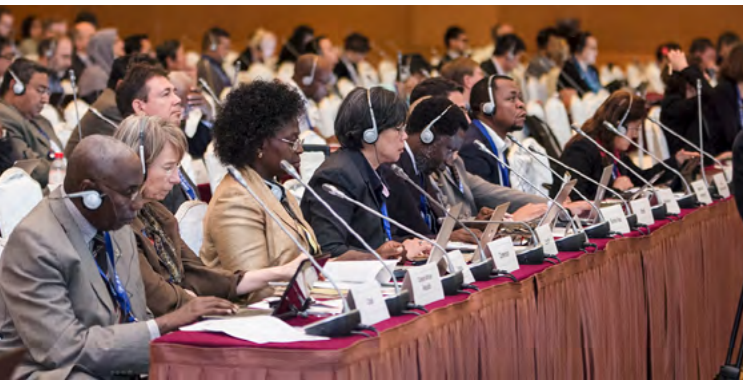
Participants during contact group at IPBES-4, Kuala Lumpur, Malaysia 2016.