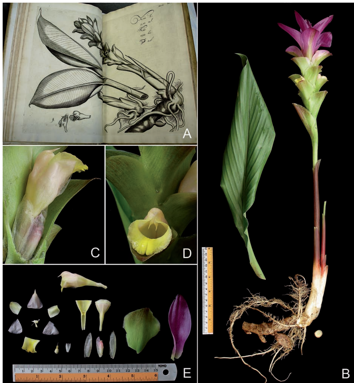
Fig. 1. Curcuma zedoaria (Christm.) Roscoe: A, original illustration of Rheede's Kua (Rheede tot Drakenstein 1692: Table 7); B, plant habit; C, flower in fertile bract (side view); D, flower in fertile bract (front view); E, flower dissection. B–E Based on Škorničková 84120.

zedoaria should, therefore, be considered an isonym, having no nomenclatural relevance. It is interesting to note that Roxburgh understood C. zedoaria differently from C. zedoaria sensu Roscoe or from C. zerumbet Roxb. (see below). The name “ C. zedoaria Roxb.” was always treated as a synonym of C. aromatica Salisb. as proposed by Roscoe (1816) but this judgement was based solely on the fact that both names refer to taxa with green leaves, which are sericeous underneath. Shedding light on the identity