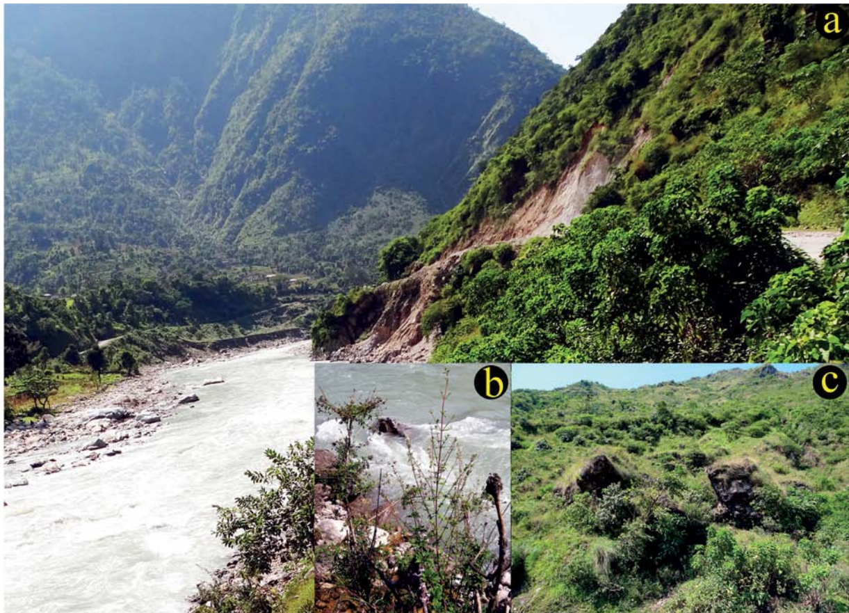
Fig. 2. Leptodermis riparia : a. type locality near Balwakot along the bank of Kali river (Nepal in the far left of the photograph); b. riparian habit; c. habitat on rocky slopes.