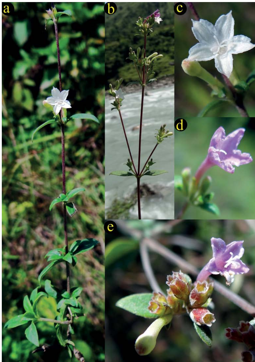
Fig. 3. Leptodermis riparia : a and b. Flowering branches; c. flower showing styles and pilose surface inside; d. mature flower; e. flower bud, mature flower and fruits.

Distribution in Western Himalaya: Balwakot (29°48'8.69" N, 80°27'11.63" E, 725 m); Bungachhina (29°41'52.78" N, 80°11'42.22" E, 1460 m); Dungrakot (Wadda) (29°31'53.45" N, 80°18'40.83" E, 1525 m) in Pithoragarh district, Uttarakhand.