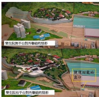
photo1)The last landscape Determined by the Government

1) Because seriously geological damages, slip, Please request Taiwan authorities to "Suspend MRT Construction", not to be deceived by politicians and plutocrats who claim estate developing for "public benefit".