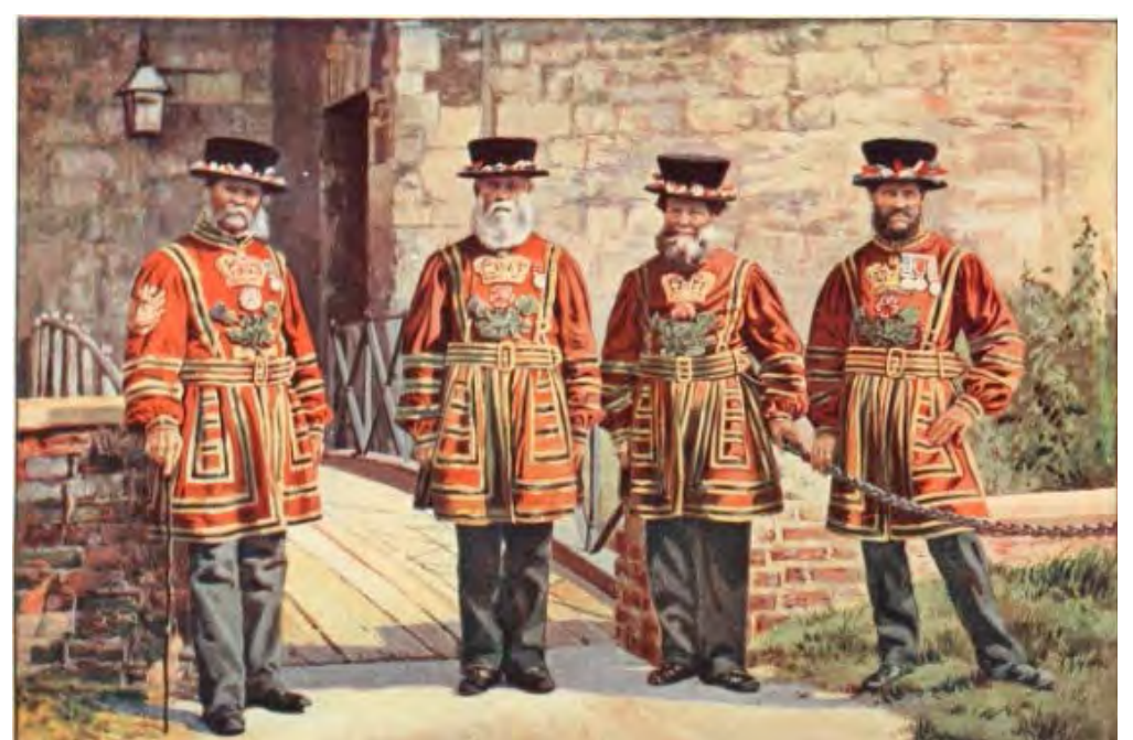
Her Majesty's Tower by Hepworth Dixon http://hdl.handle.net/2027/uc2.ark:/13960/ t2t43pv37 ...