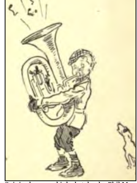
Original pen and ink sketches by Phil May. Original book price: one shilling. http:// hdl.handle.net/2027/uc2.ark:/13960/ t58c9tfom ...

After discussions with University of Michigan accessibility consultants, we have deployed changes to the PDF production pipeline: PDFs of scanned image volumes use layers for watermarks and add contents outlines. HathiTrust now can serve born-digital PDFs from the repository after attaching watermarks (currently limited to Knowledge Unlatched items).