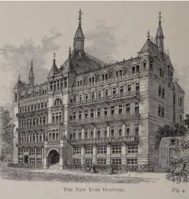
Hospital Construction and Management, 1883. http://hdl.handle. net/2027/gri.ark:/13960/t86h8tf95 ...