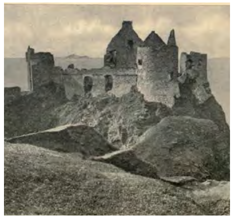
Ruins of Dunluce Castle, Antrim http:// hdl.handle.net/2027/uc2.ark:/13960/ t24b2zj11 ...

Accessibility audit of HathiTrust apps/interfaces in Production.