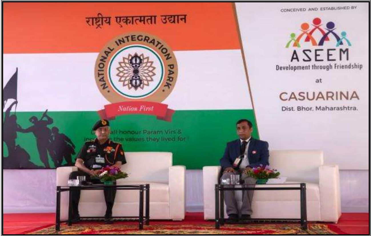
Inauguration Event on December 22, 2021

The concept of National Integration Park is conceived and developed by Aseem Foundation. It was inaugurated on December 22, 2021 by the hands of General MM Naravane, Chief of the Army Staff .