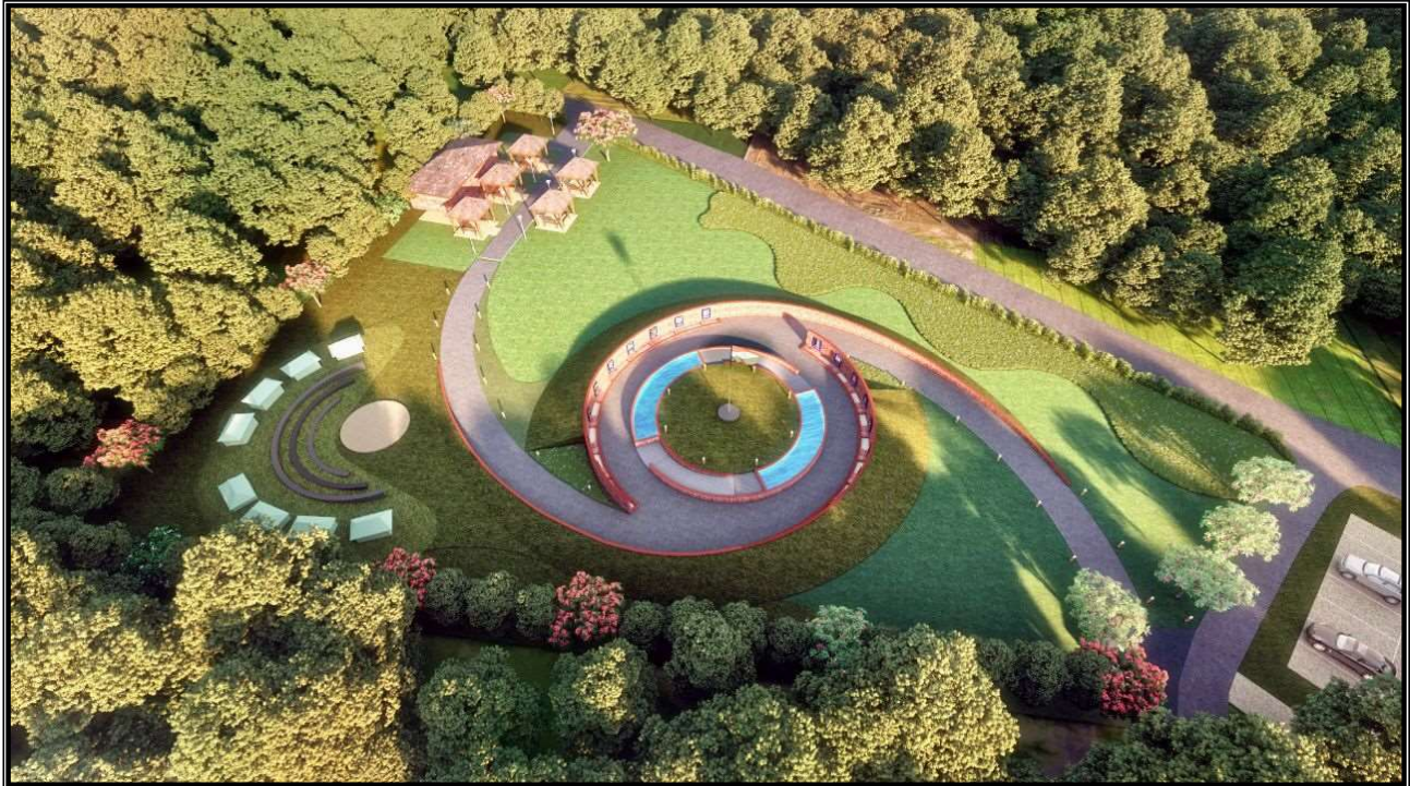
An indicative layout of Aseem's National Integration Park