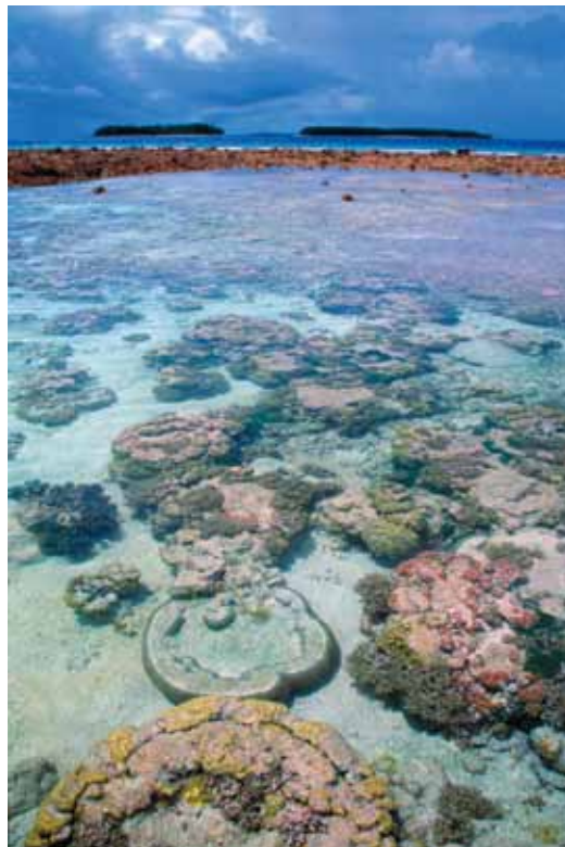
Copy cat. Marine corals, such as this reef in the North Pacific, inspired the idea for seawater cement.

If researchers can develop a valuable product that gobbles up CO 2 during manufacture, however, that would dramatically lower the cost barrier to megascale carbon capture, he says. And for Constantz, the most obvious candidates are cement, concrete, and the mix of sand and gravel known as aggregate, all of which are used to build infrastructure, from bridges to buildings. The world today produces some 2.5 billion tons of Portland cement annually, for example, as well as 12.5 billion tons of concrete and 32 billion tons of aggregate. Using those mountains of material to trap