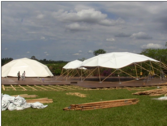
Figure 15: Assembly Process of the covers

Once finished, the pieces are stored in a cool place with controlled humidity, thus ensuring longer durability for the material (Figure 15).