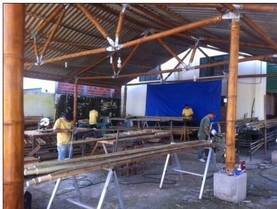
Figura 10 : Domebambu Fabric

The structures are manufactured in DOMEBAMBU STRUCTURES's headquarters, located in Administrative Region of Paranoá, Brasília-DF (Figure 10). The company has qualified personnel and tools necessary for the manufacture of frames (bamboo pieces already ready and installed connections).