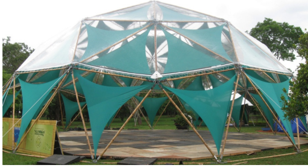
Figura 01: Imagem DOME_20 with cristal membrane

From the first demand for the construction of the first geodesic dome Bamboo and membrane (Figure 01), the Domebambu prepared the planning of this project, which included the definition of stages of geometry and materials to be used, the structural design to manufacturing the assembly and disassembly, taking as a premise, the development process based on the concepts of sustainability