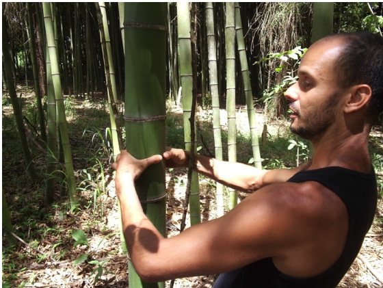
Figure 08: Selection of the appropriate diameter culms

After completion of the project and details of the structure, defining the number of pieces, size and type, then set off to harvest in place near the city of Brasilia. Once in the woods, choosing the right bamboo requires knowledge both technical and experience. the selection of the culms should be made according to the maturity of the plant, and making the cuts properly to provide the health of the bamboo grove (Figure 08).