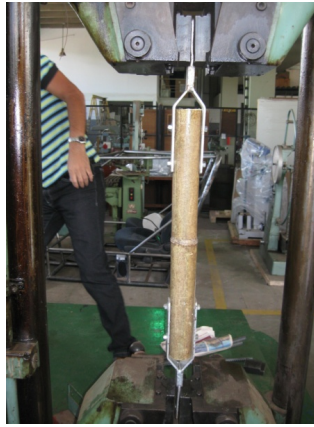
Figure 06: Test of resistance metal bamboo-union

Tests conducted as metal bamboo-set union gives sufficient strength to withstand stresses involved in DOME BAMBU covers.