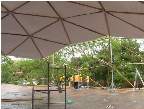
Figure 14: Assembly Process of the covers

Once finished, the pieces are stored in a cool place with controlled humidity, thus ensuring longer durability for the material (Figure 15).