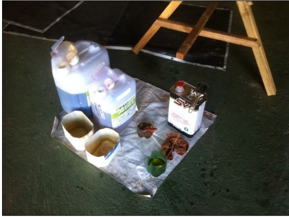
Figure 07: PU Mamona resin used for bonding ribs

The Polyurethane Resin Plant the Mamona base (Figure 07) is considered low impact on the environment, therefore much of its raw material comes from the mamona oil, the result of a very common plant in Brazil.