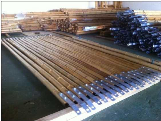
Figure 12: Parts ready for application of protective resin