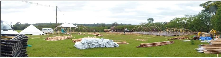
Figure 13: On Assembly