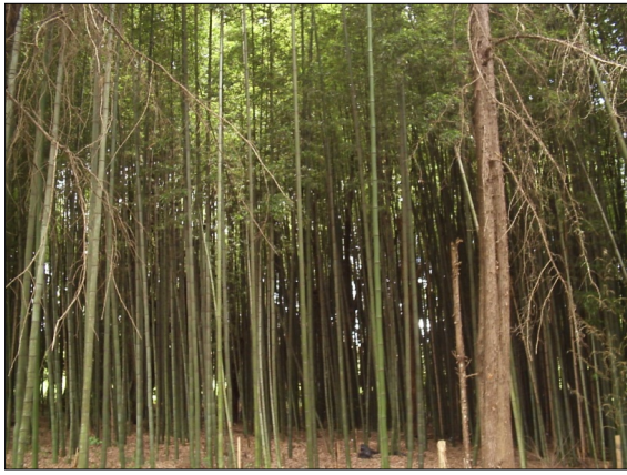
Figure 03: Phyllostachys bambuzoides forest