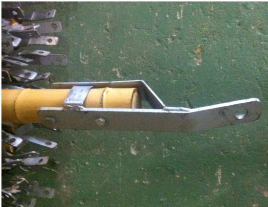
Figure 05: Detail connective system Domebambu

The metal connectors were designed obeying the efforts identified in the calculation of the structure, detailed in CAD environment and reported to the company that manufactures metal structures (Figure 05).