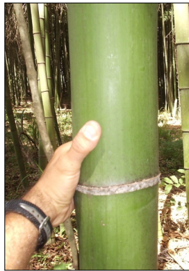
Figure 04: Detail of bamboo culm Phyllostachys bambuzoides

The species used in Domebambu cover is quite suitable for this use, therefore, has great especially resistance to tensile and compressive efforts. Table 01 presents resistance tests performed on stalks harvested at different ages, reinforcing the need for the harvest is carried out over 3 years after the birth of the shoot.