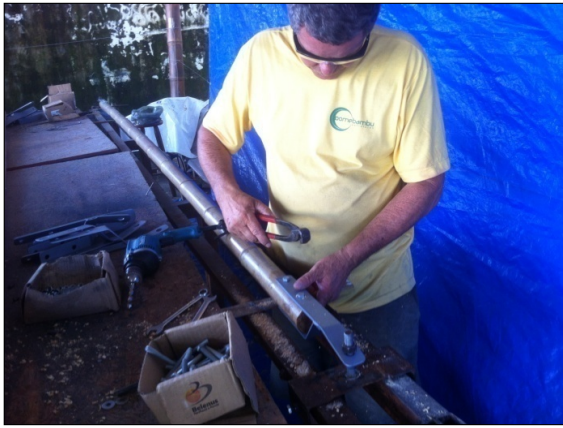
Figure 11: Installing the metal connectors on bamboo