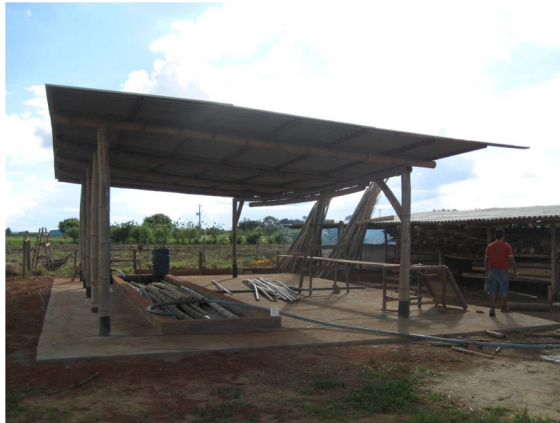
Figura 09: Treatment area

The culms are gathered for an outdoor drying process (Figure 09) and follow posteriormente for treatment by immersion in a tank with octaborato for at least 10 days.