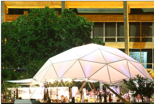
Figura 17: Cover Assembly on RIO+20 Conference