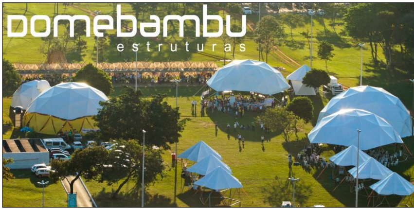
Figure 16: Coverage of different sizes mounted on event