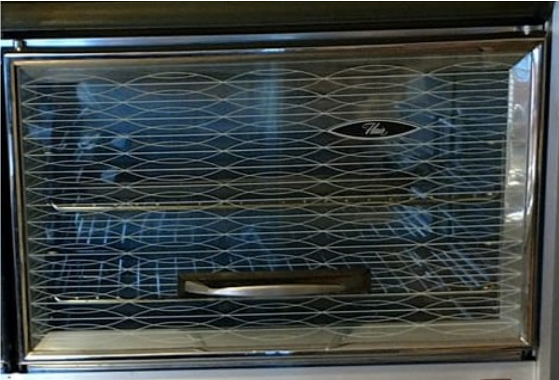
1965: Door graphic has horizontally oriented rectangles.