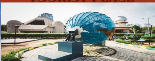
Jawaharlal Nehru Planetarium (13 Km from UAS Bengaluru)