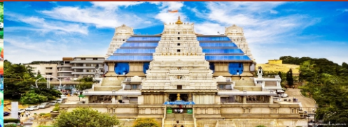
ISKCON Temple, Bengaluru