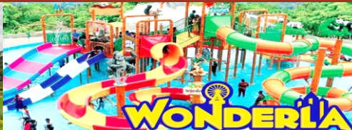
(39 Km from UAS Bengaluru)