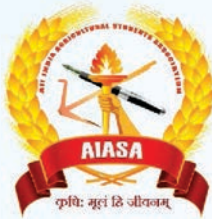
All India Agricultural Students Association