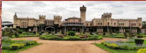
Bengaluru Palace: (13 Km from UAS Bengaluru)