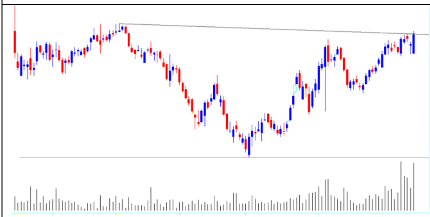
BANK OF BARODA (315) Dly. Chart View: Positive Bias*