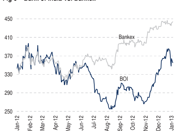
Fig 6 – Bank of India vs. Bankex