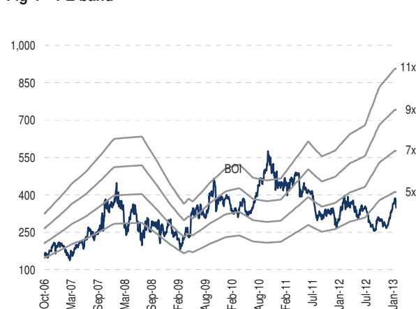
Fig 4 – PE band