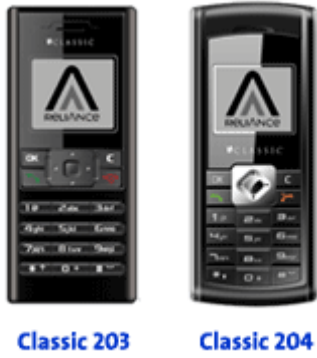
Figure 2: RCOM: Classic range of handset models