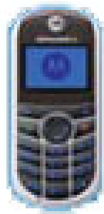
Figure 3: Tata Indicom Handset (Motorola W 150i)