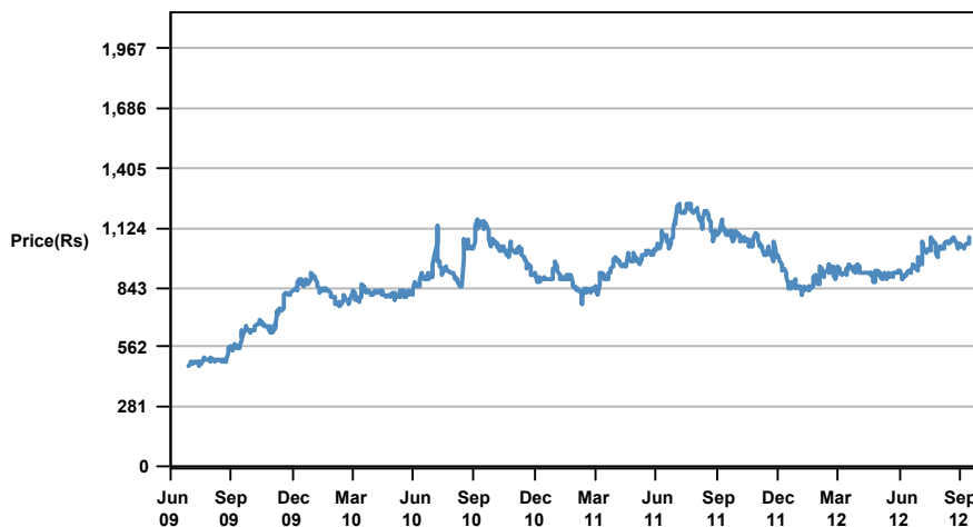
Trent Limited (TREN.NS, TRENT IN) Price Chart

price data adjusted for stock splits and dividends.