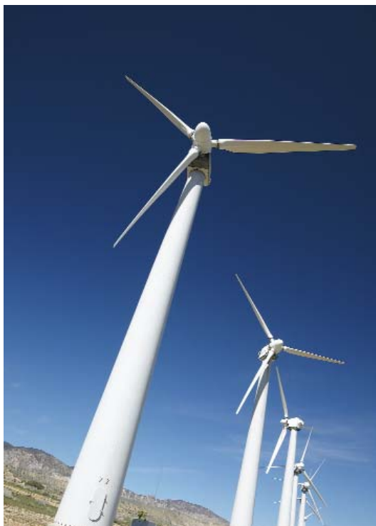
Total Installed Capacity of Power in India as on 16th February 2007