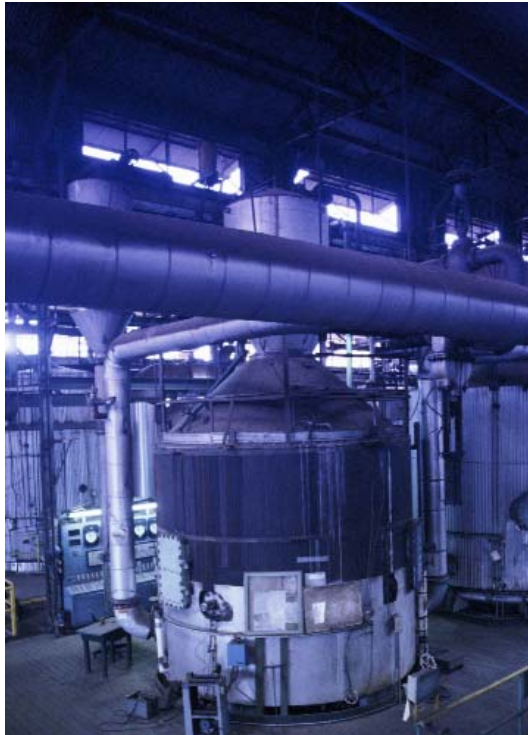
Union Budget 2007- 08