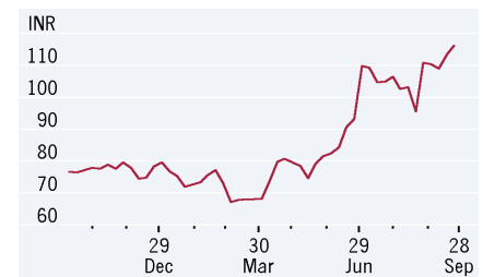
Figure 1. Statistical Abstract