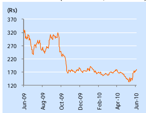
Price Performance (RIC: RLCM.BO, BB: RCOM IN)