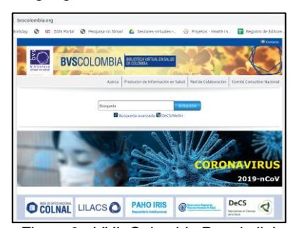
Figure 3 - VHL Colombia Portal - link to the Window of knowledge