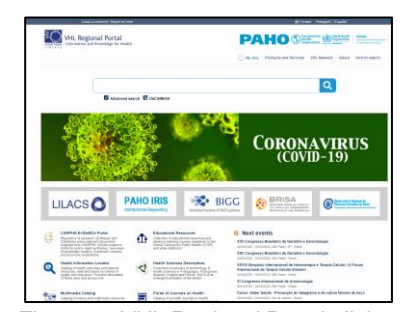
Figure 1 - VHL Regional Portal - link to the window of knowledge

It is recommended to create a highlight on the VHL portals with a link to the Coronavirus Window of Knowledge and to create a search strategy that facilitates the retrieval of documents on this subject. Examples of highlights created: