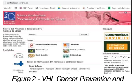
Control Portal - search strategy