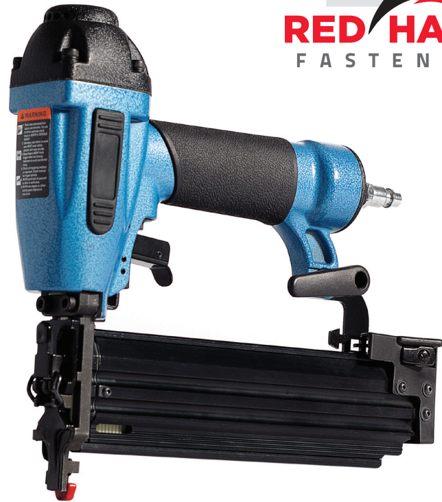
FN/15S FINISH NAILER