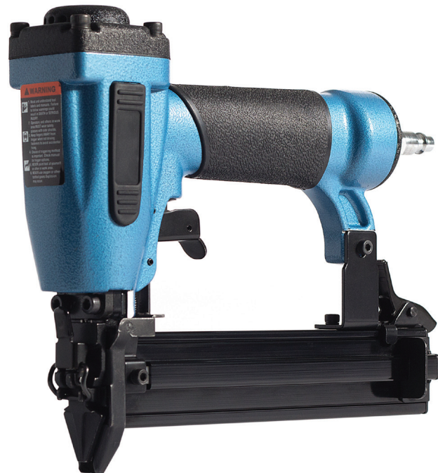
BT/18S BRAD NAILER

GAUGE: 18 FASTENERS PER STRIP: 50 FASTENER RANGE: 7/16", 5/8", 3/4" MATERIAL: Thermoplastic Resin and Fiberglass