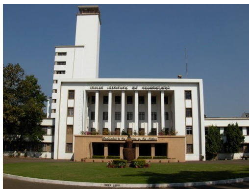
Indian institute of technology Kharagpur

Climate: Winter (October to February) is moderate and pleasant (10 to 25 C) in Kharagpur. Summer (March to June) is hot (25 to 40 C) and sometimes humid. Rains are normally confined to the months of June to September.