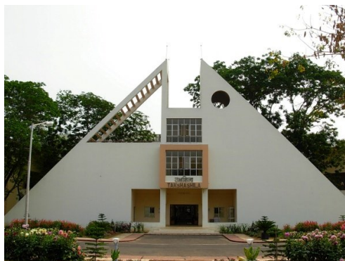
Centre for Educational Technology