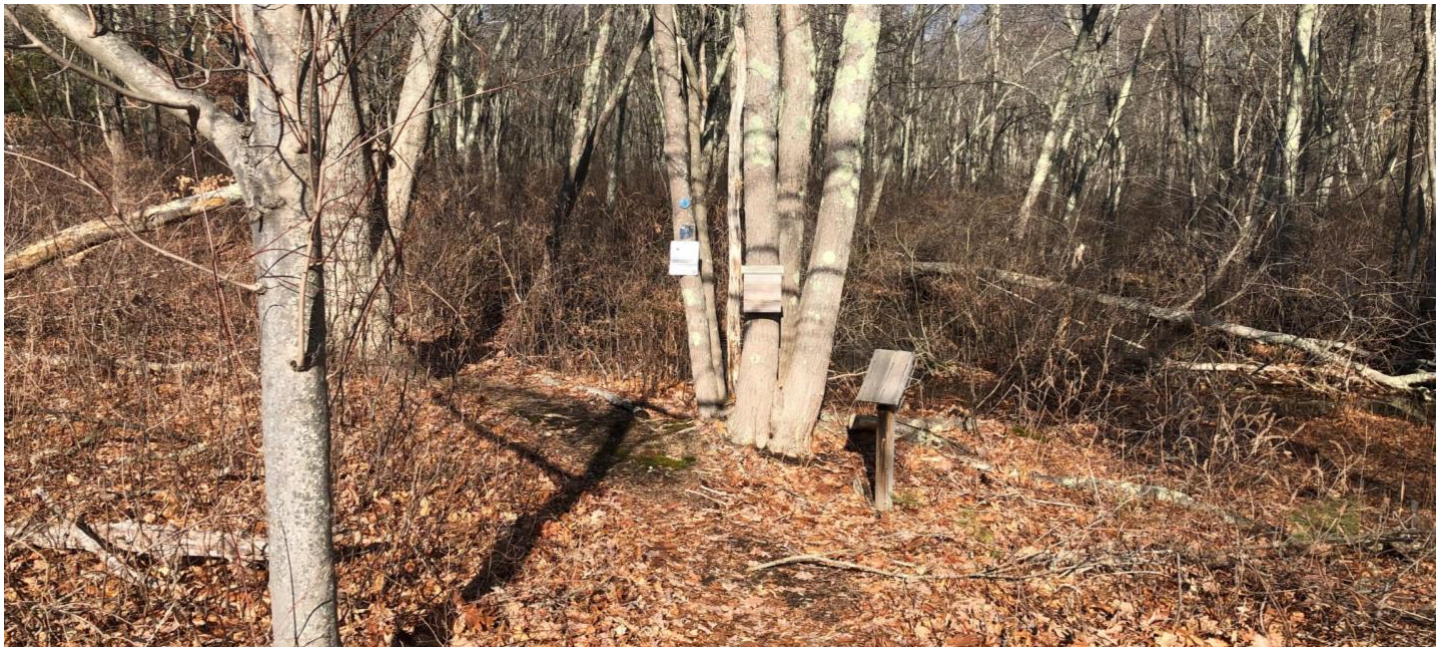
Blue Trail Entrance on Davis Rd.