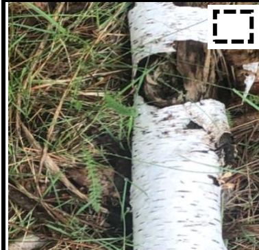
Birch Bark from Tree