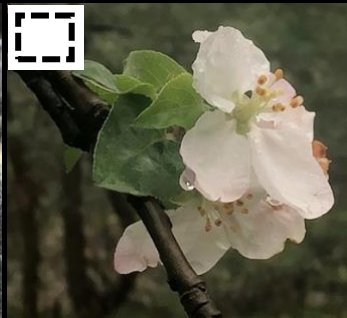
Flowers on Tree