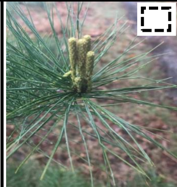
White Pine Needles