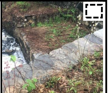
Wilson Mill Site