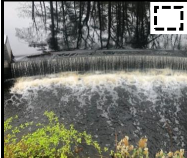
Weir (low dam)