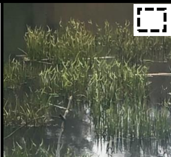
Grasses in pond