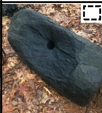
Rock with Hole