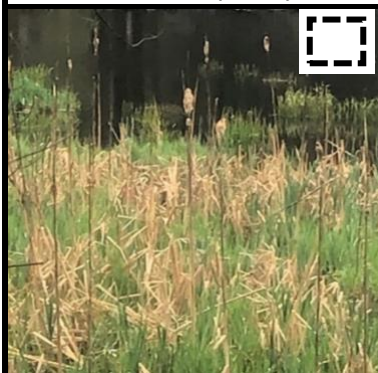
Grass w. cattails