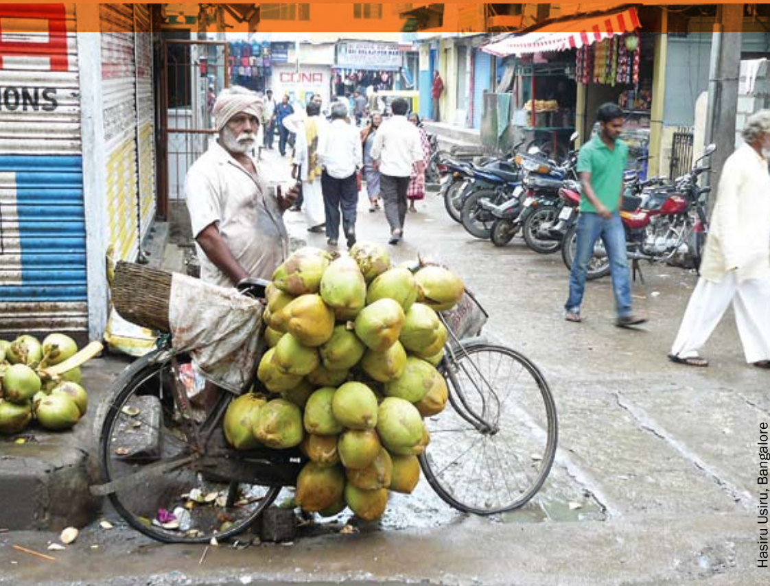
Hasiru Usiru, Bangalore