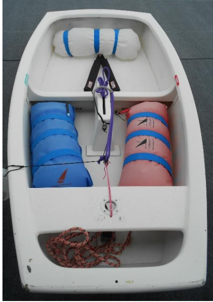
AYC #13 (MGH09312I999) 1999 McLaughlin World Champion hull in fair condition (will need fiberglass repair to port bow corner and starboard)