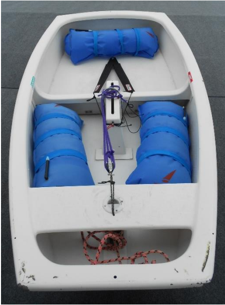
AYC #14 (MGH09381I999) 1999 McLaughlin World Champion hull in fair condition (will need fiberglass repair to mast step and bow corners)