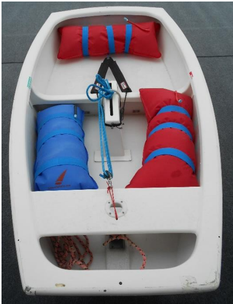
AYC #11 (MGH09359I999) 1999 McLaughlin World Champion hull in fair condition (will need fiberglass repair to port rail and bow corners)

These AYC Optimist hulls are the perfect fixer-upper for new sailors and Green Fleet racers. Please note that all four hulls are in need of repair and all AYC equipment is sold AS IS. All sales are FIRST COME, FIRST SERVE and FINAL.