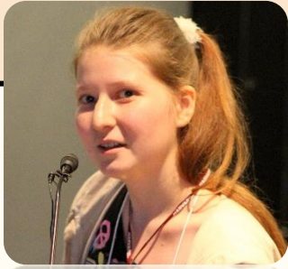
Ms. Alexandra Elbakyan Creator of Sci-Hub