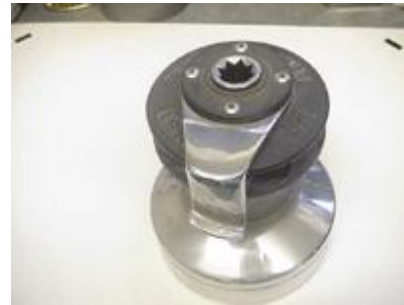
Wave Grip (4 Cross Head Screws)

Wavegrip Self-Tailing Winches were produced between 1983-1991 (approx.) and are identified by either 4 cross head screws or allen bolt securing the top cap. They also have fixed jaws. Details of spares are available on request, please contact us and we will be pleased to help. Please note that some winch sizes have only a limited range of spares available.