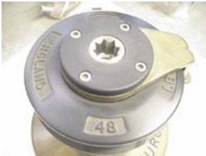
Wave Grip (4 Allen Screws)