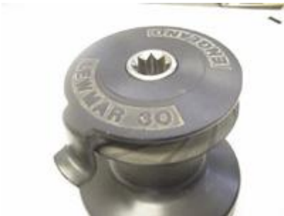
Hold Fast (Screw on Upper Crown)

Hold Fast Self-Tailing Winches were produced between 1978 - 1983 in Sizes 16, 30 & 34 and can be identified by their one piece upper crown and feeder arm that screwed directly on top.