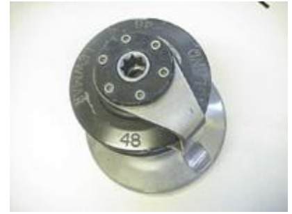
Old Spring Jaw Version (6 Allen Screws)

The earliest self-tailing winches, Spring Jaw, were produced between 1975-1977 and had 6 allen screws securing the top cap. Again, spares for these winches are now very limited, but please contact us and we will do our best to help.