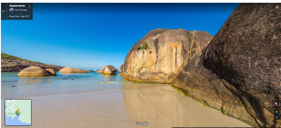
Elephant Rocks (near our current location)

Thank you for your continued support. Yours in the Immaculate Heart.