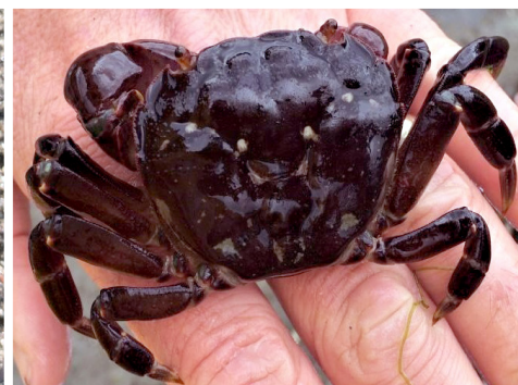
Purple shore crab