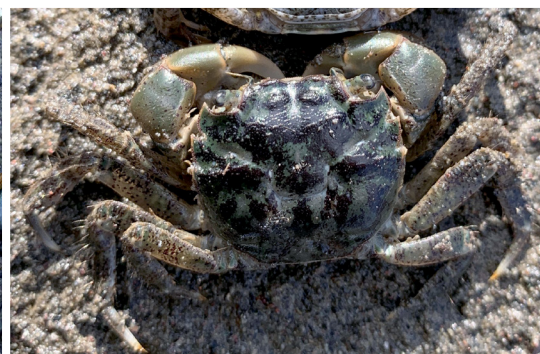
Hairy shore crab