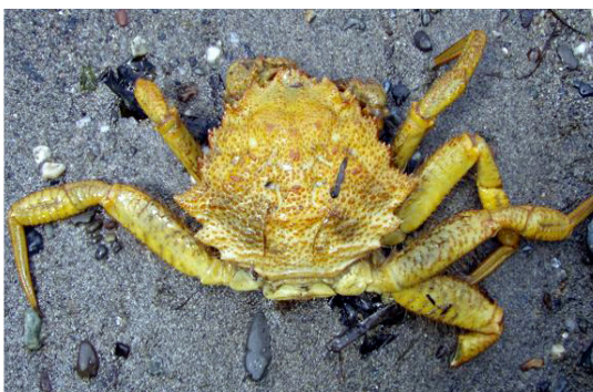
Hairy helmet crab

Native crab species commonly mistaken for European green crabs include: